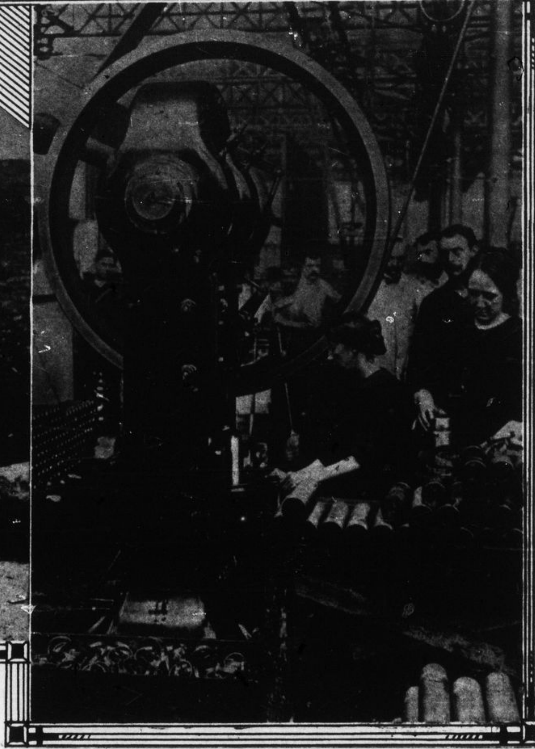
French women working in ammunition factories. Photo shows gauging.