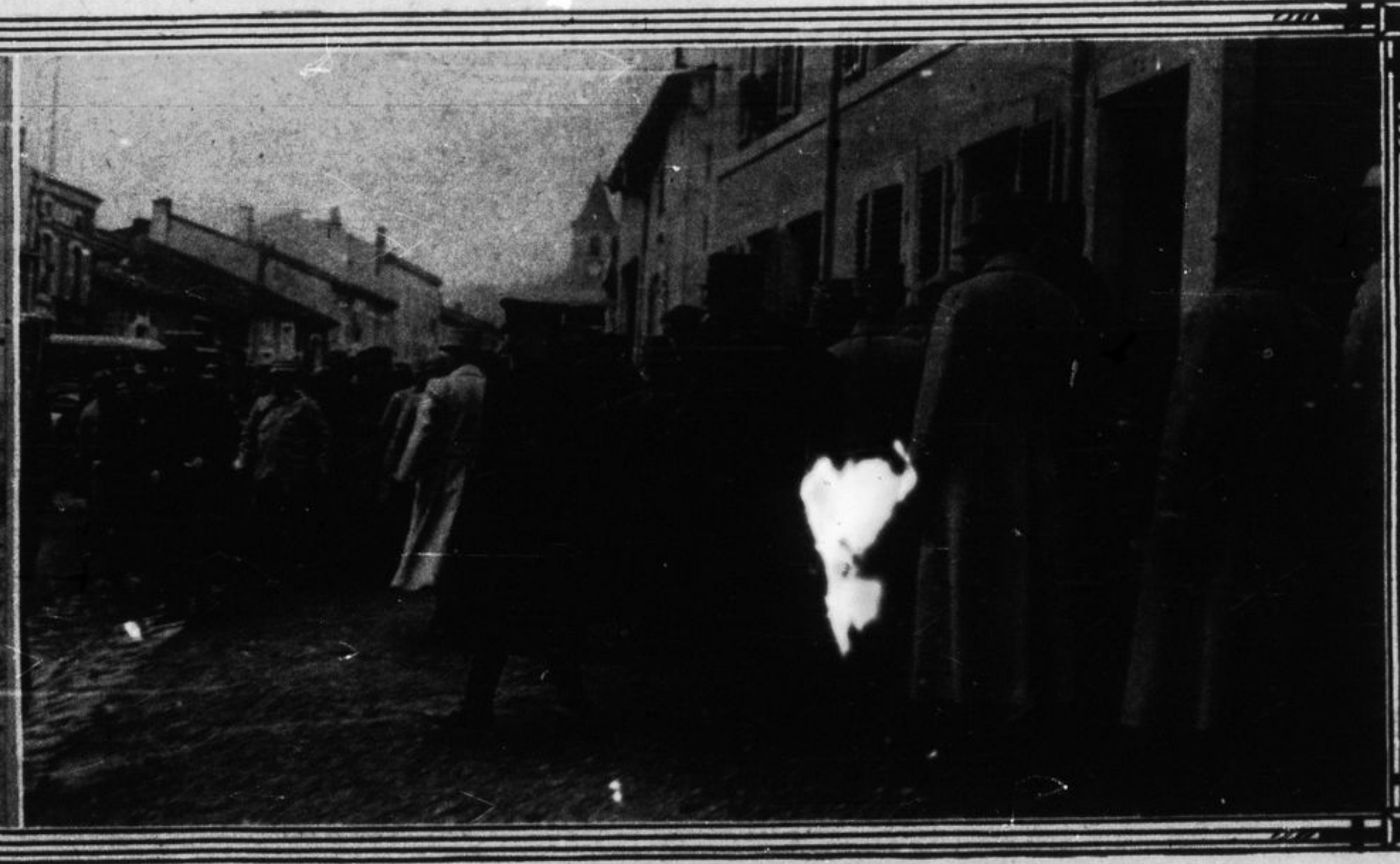
President Poincaré and Gen. Joffre visiting a recently occupied village in Lorraine.