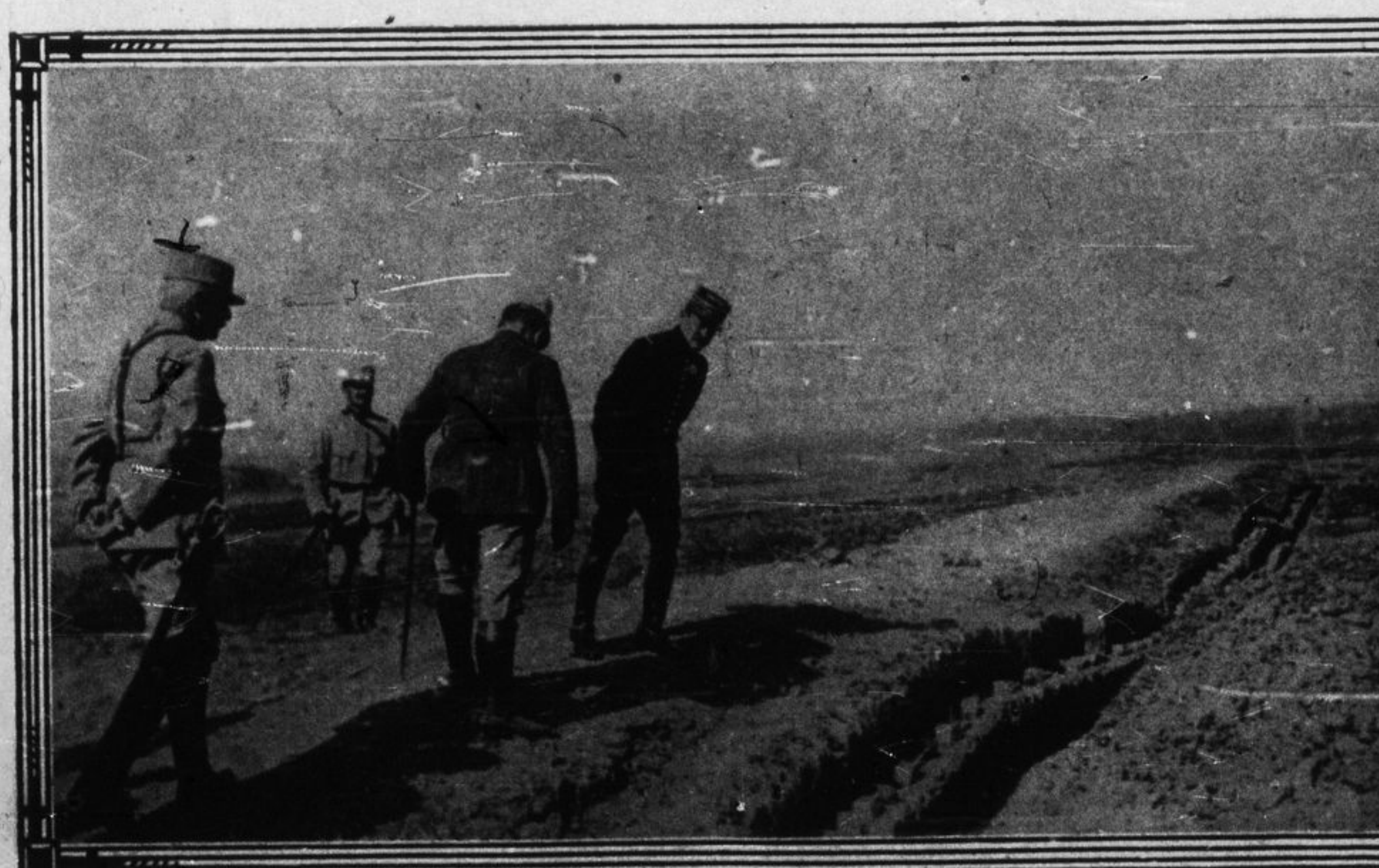
Gen. Humbert and Gen. Dubail examining a French trench with a hand grenade squad ready to make assault.