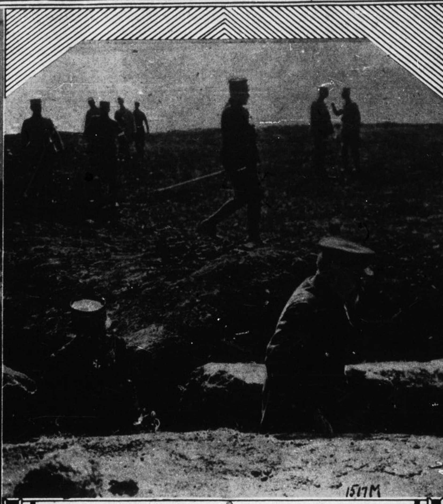
President Poincaré examining trenches in forest of Le Pretre.