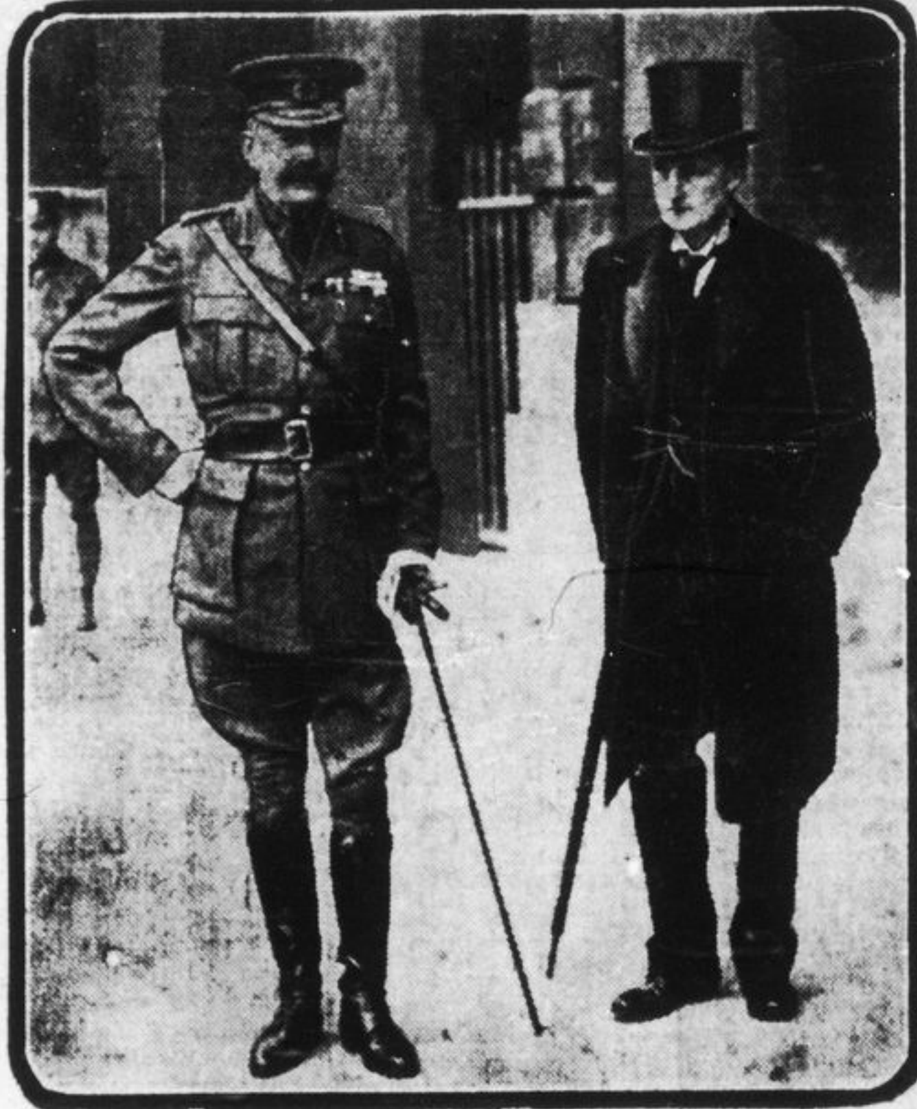
KITCHENER AND GREY IN PARIS. Photo shows British Ministers of War and Foreign Affairs, on their way to attend a War Council in Paris.