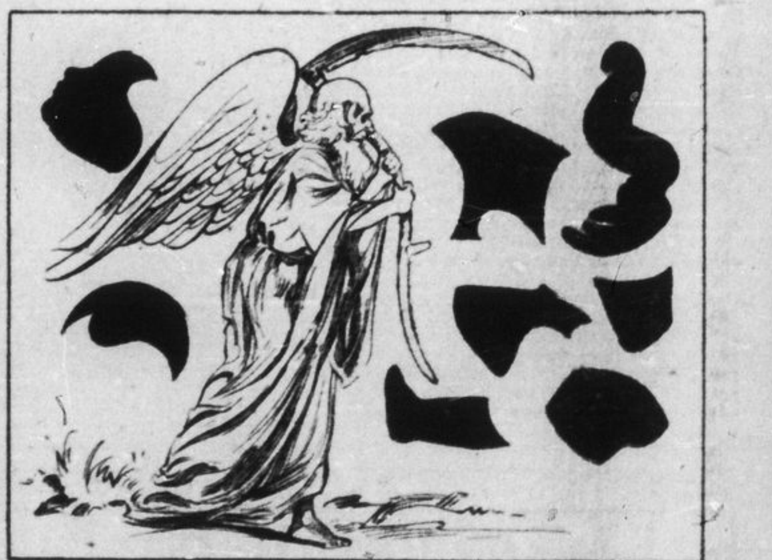
NEW YEAR PUZZLE. Here is Old Father Time and his scythe. Little New Year is also in the picture. See if you can find him by cutting out the black pieces and putting them together correctly.

Love and coins may be tested by the ring.