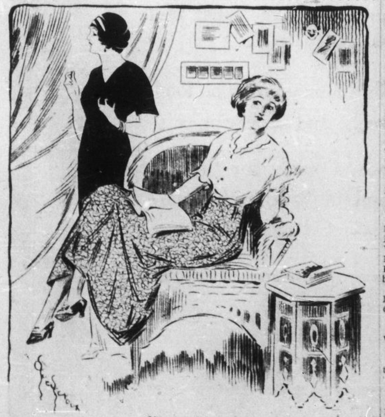
Morning After. Was your husband delighted with the Christmas gift you put on the tree for him? Yes, until he found out I had it charged.