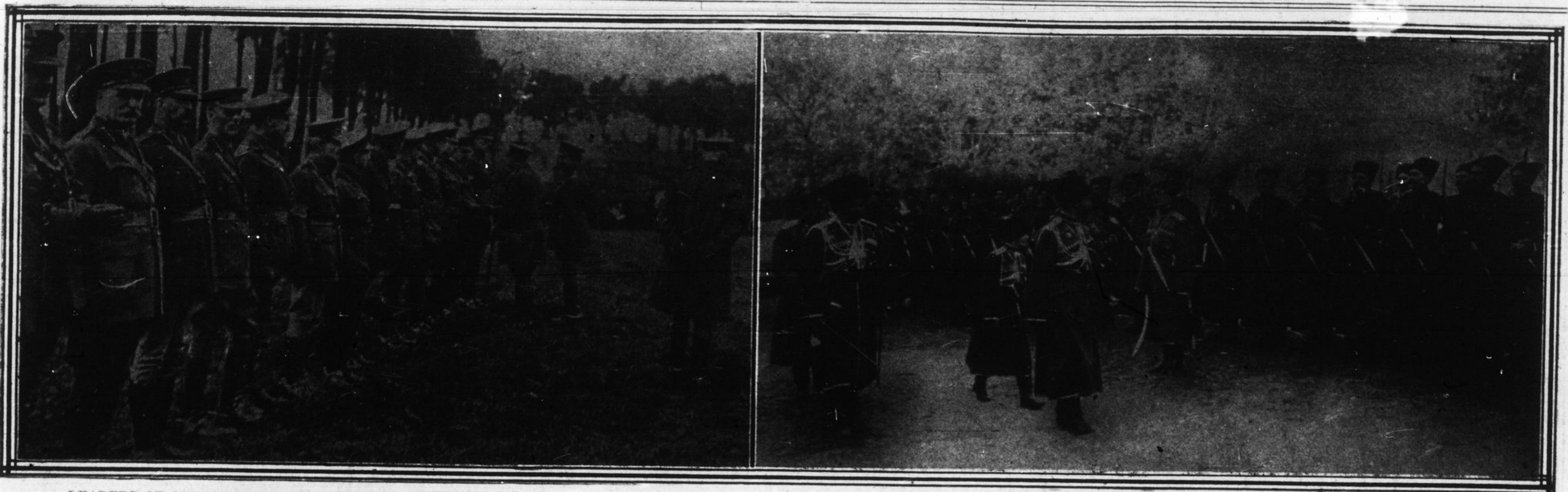
LEADERS OF OVERSEA TROOPS FACE TO FACE WITH THEIR KING: HIS MAJESTY SPEAKING TO CANADIAN GENERAL OFFICERS.