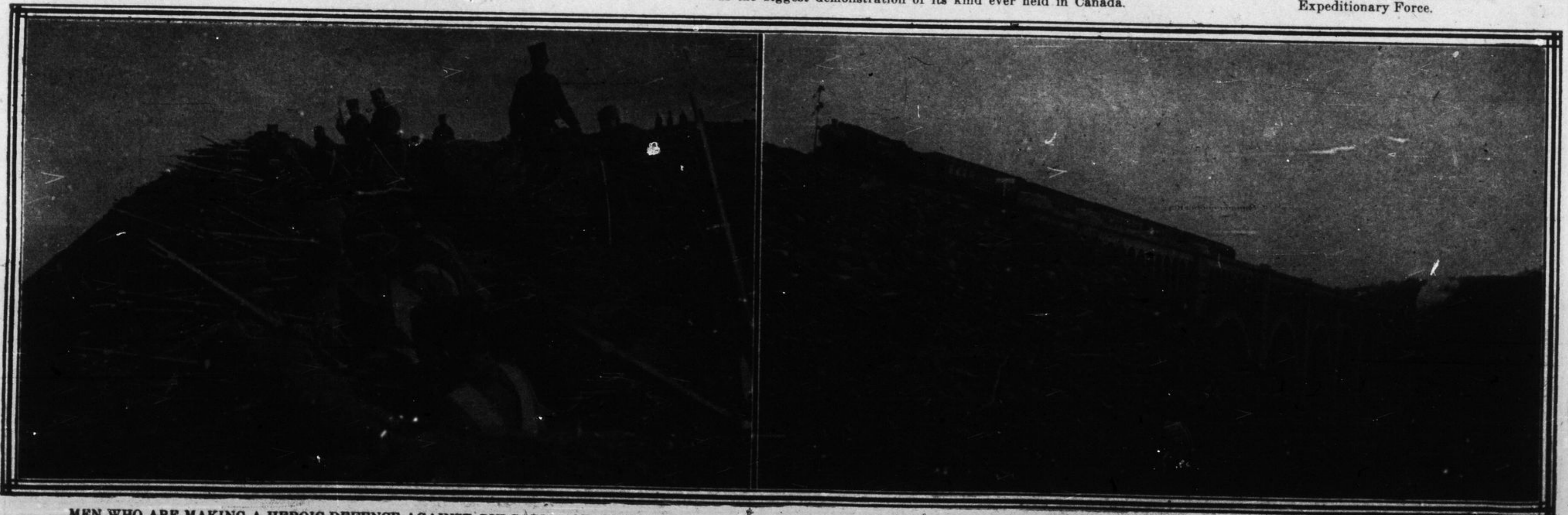
MEN WHO ARE MAKING A HEROIC DEFENCE AGAINST BULGARIA AND GERMANY: SERBIAN INFANTRY MANNING A HILL-TOP TRENCH.