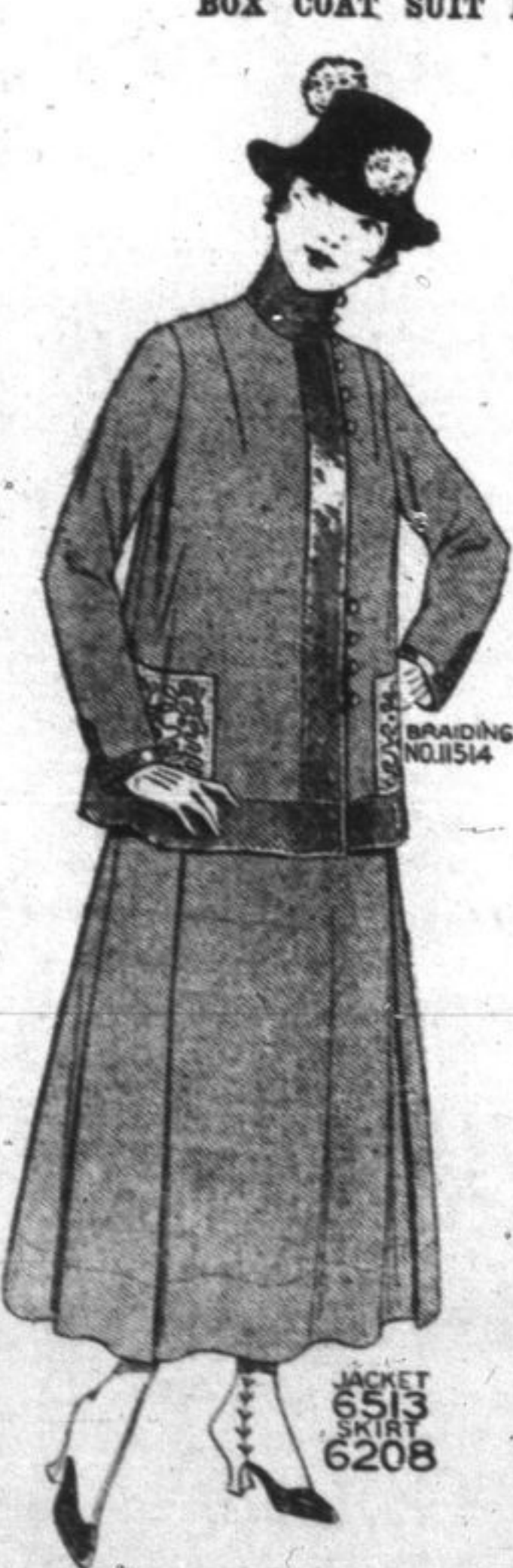
As a change from the costumes in smooth-finished cloths this box coat her sisters.