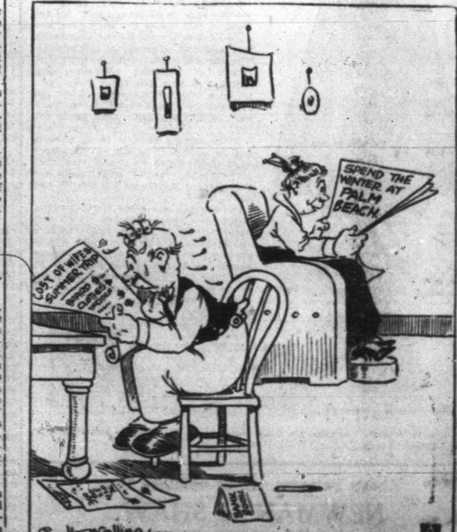
and the Worst is Yet to Come.