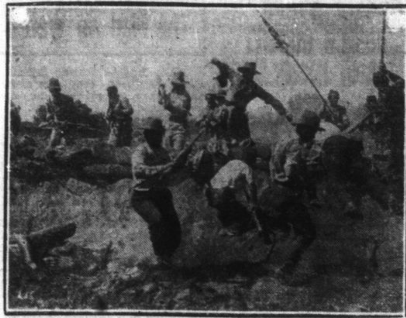
One of the war scenes in "The Birth of a Nation," at the Grand Opera House, for three nights and two matinees, commencing Thursday, November 18th.

London. Greater London has more than doubled its population in the last 50 years, the figures in 1861 being 2,322,720, while now they are 7,252,963.