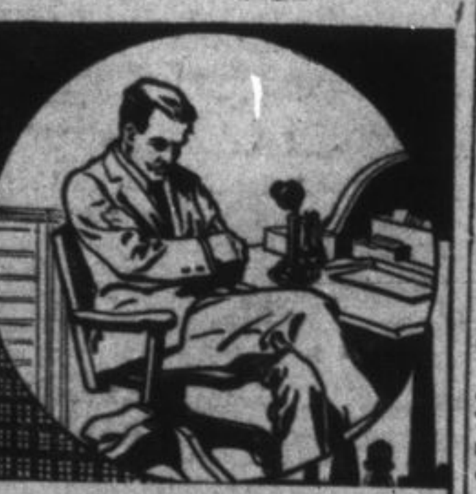
Low spirits, discouragement, the blues usually result from a tired brain and exhausted nervous system. Start the rebuilding process to-day by beginning the use of the greatest of nerve restoratives.

The men of the 80th Battalion held a jollification on the streets on