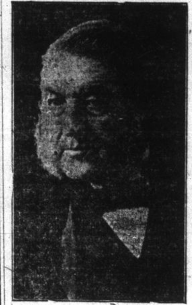
LATE SIR CHARLES TUPPER.

Sir Charles Tupper was born at Amherst, N. S., on July 2, 1821, and was consequently in his 95th year. He entered Nova Scotia politics in 1855 and up to 1900 was with few interruptions prominent in the history of the country's development. He took an active part in the fight for Confederation prior to 1867, and after filling several portfolios in the Dominion Government was appointed to the High Commissionership for Canada in London, where he served several years. He returned to Canada in 1896 and was induced to re-enter politics with a view to saving the Conservative party from the misfortunes which were threatening. He was appointed Premier, but in a few months his Government