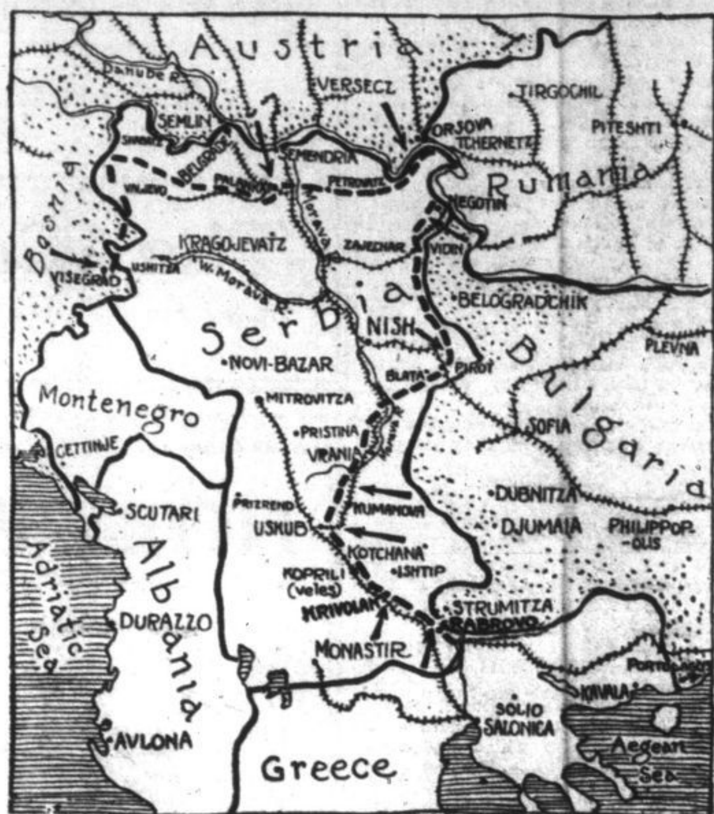
THE SERBIAN CAMPAIGN. Map shows the situation in Serbia. A French army has checked the Bulgarian advance on Monastir.