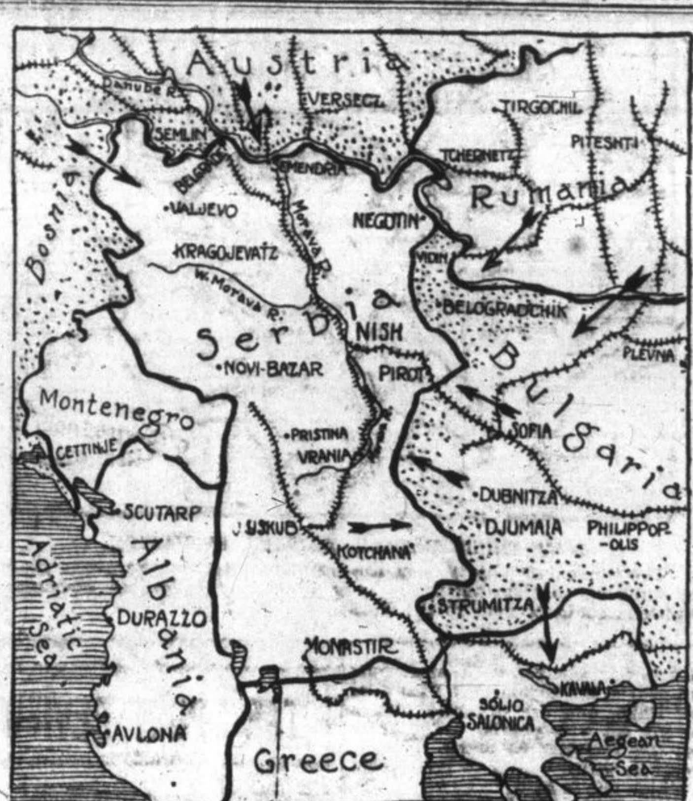
WHERE BALKAN ARMIES COULD STRIKE. Map suggests the direction in which the rival armies would be launched in the event of Bulgaria co-operating with the Germanic forces against Serbia, Greece and Roumania. The shaded portion of frontier represents enemy territory.

AUSTRIA GERMANIZED The Germans Are Working Out Their Programme. Berne, Sept. 24.—The Germanization of Austria continues steadily. The latest development is a congress of municipal representatives of German-speaking Austrian towns, ostensibly for helping the municipalities to adapt themselves to war conditions, but really more for the consolidation of the German-speaking element in the Austrian Empire. Next Sunday the foundation stone will be laid on the Austro-German frontier of the so-called Turm der Bundesgenossen, or "Tower, Sealing the Bonds of Fellowship between Germany and Austria-Hungary." Building operations will be begun, it is stated, immediately. The lower part of the tower will consist of a memorial hall, the walls of which are to be covered with tablets commemorating the names of soldiers of neighboring towns who have fallen in the war; while the upper portion will take the form of a vast urn in which it is proposed to kindle fire on all German and Austro-Hungarian national festival days. The tower will be over four hundred feet high.