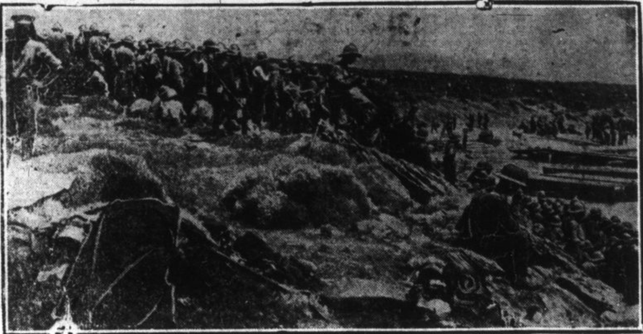
Photo shows the scene at Anafarta Bay during the landing battle which resulted in the capture of important points by the English. Note the barges used for landing under battleships' fire.

work of the night so you see I have a "snap" just now. It is quite different from the work we had in France. Taking it all through it seems just like one grand holiday since we started, and I am glad we had the chance to come to this part of the world.