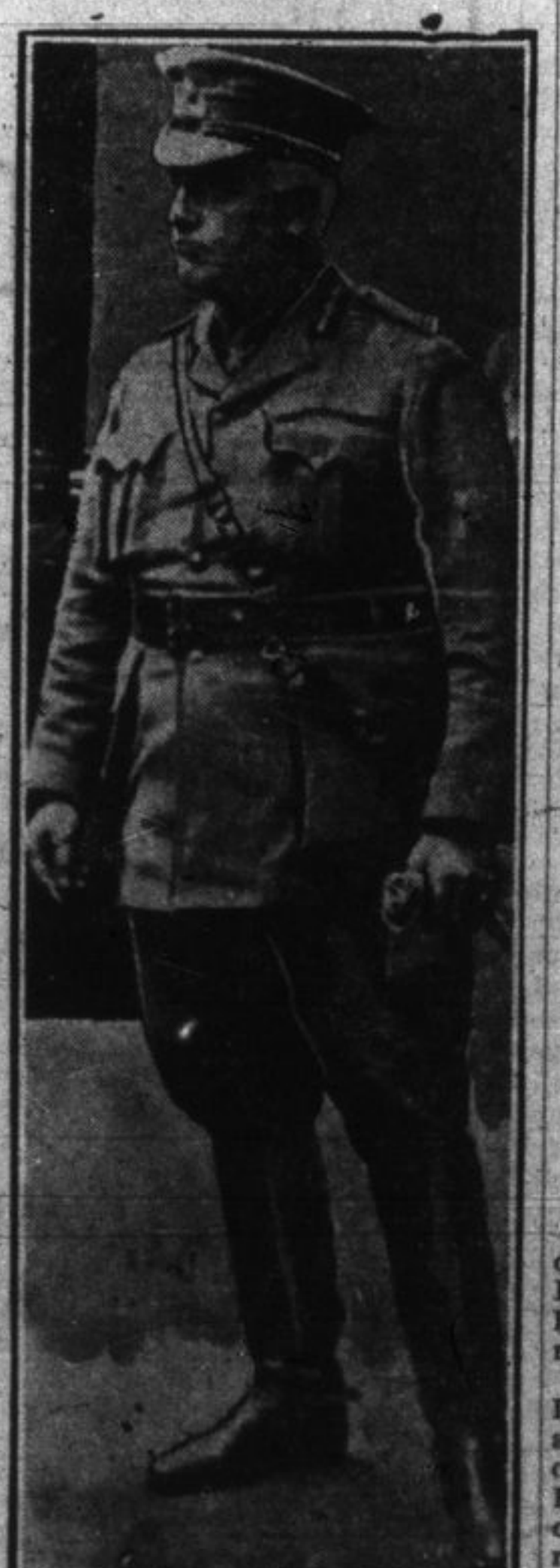
GENERAL SAM HUGHES. Canada's Minister of Militia, who was knighted on Tuesday afternoon during an audience with King George at Buckingham Palace.