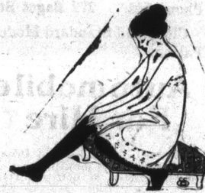
NEW WINDSOR TIES.

Yours To-Morrow, as long as lot lasts, 35c Pair