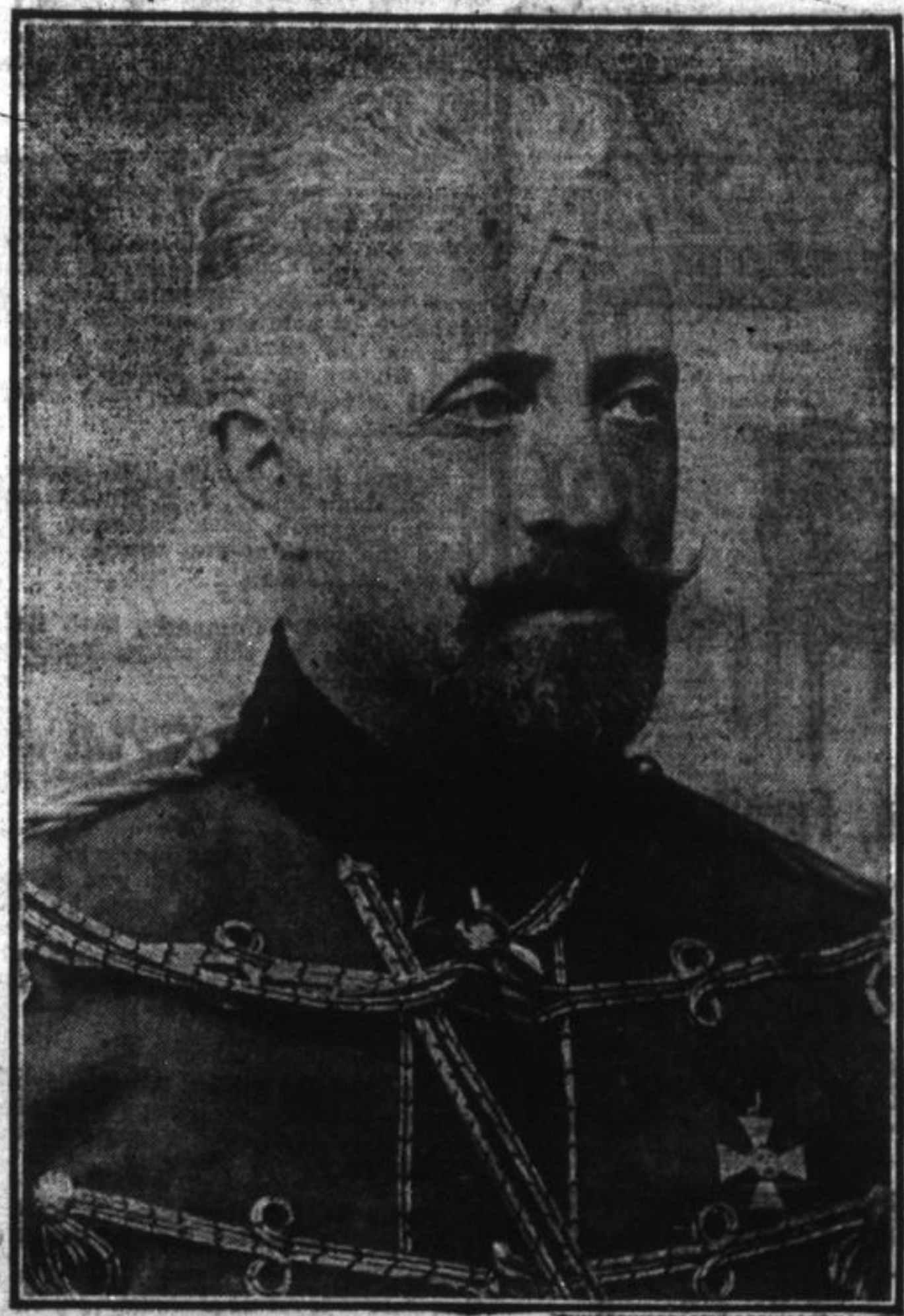
GRAND DUKE NICHOLAS

Uncle of the Czar of Russia and commander of the Russian armies in the field. He is conceded to be one of the ablest strategists in Europe. In personal appearance he is striking; he stands over six feet three inches in height and has a most distinguished and commanding presence. He is fifty-nine years old.