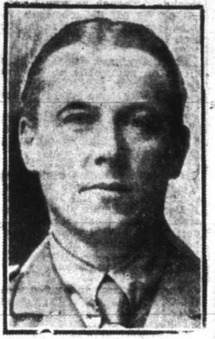
ROBERT W. SERVICE Canadian poet, travelling in the war zone at the outbreak of war in new driving a motor transport in the French army.

Milan, July 3.—All Italian consuls have received orders to leave Asia Minor. Those from Palestine have already arrived from Alexandria on the cruiser Tennessee.