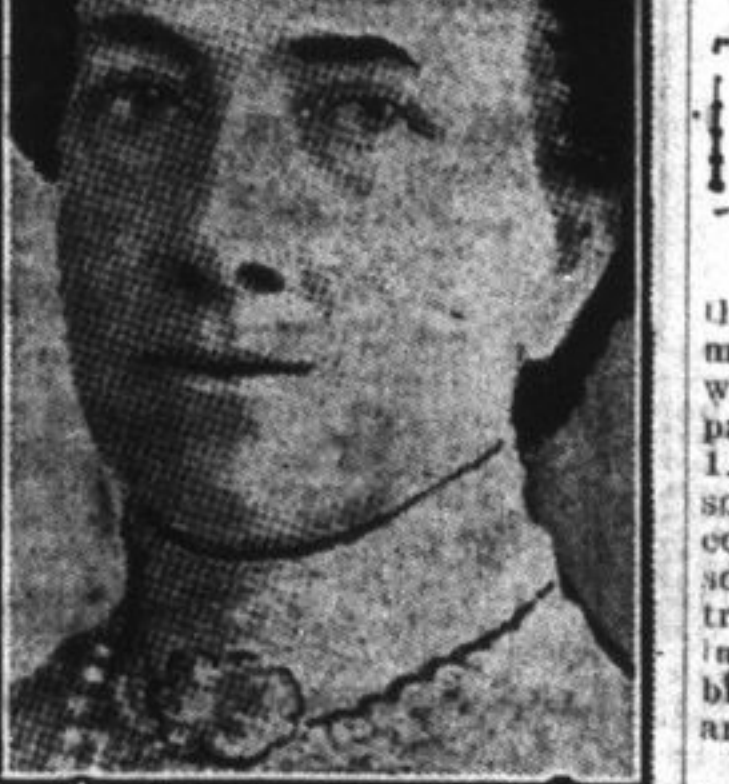
QUEEN VICTORIA OF SWEDEN. Who has been visiting her mother in Germany and she has expressed her sympathies as being with the Germans.

The afternoon promenade on the Callea Victoria strikes the foreign visitor as a little freer and more unconventional than anything of the same kind to be found in European or American cities. The man who smiles at a lady he does not know is not considered a person to be frowned upon, but is rather regarded by the majority as a commendably dashing and gallant fellow.