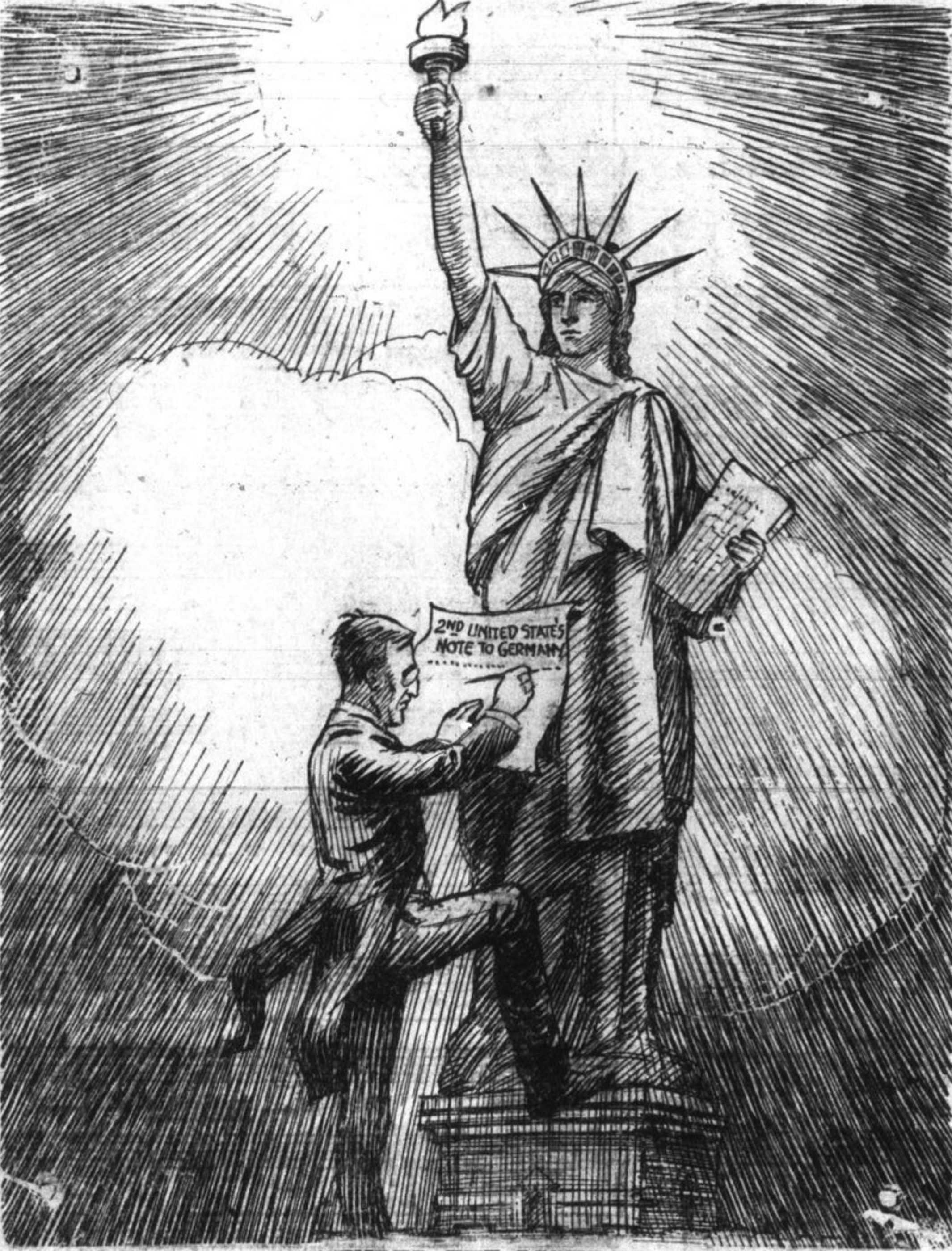
"UNDER THE LIGHT."