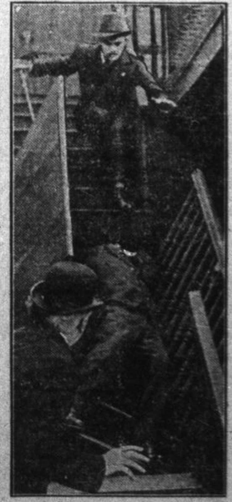
The Whole Staircase Suddenly Began to Revolve.

"Back to that house?" Lenora exclaimed with a grimace. The inspector nodded. "We have had those boys at the