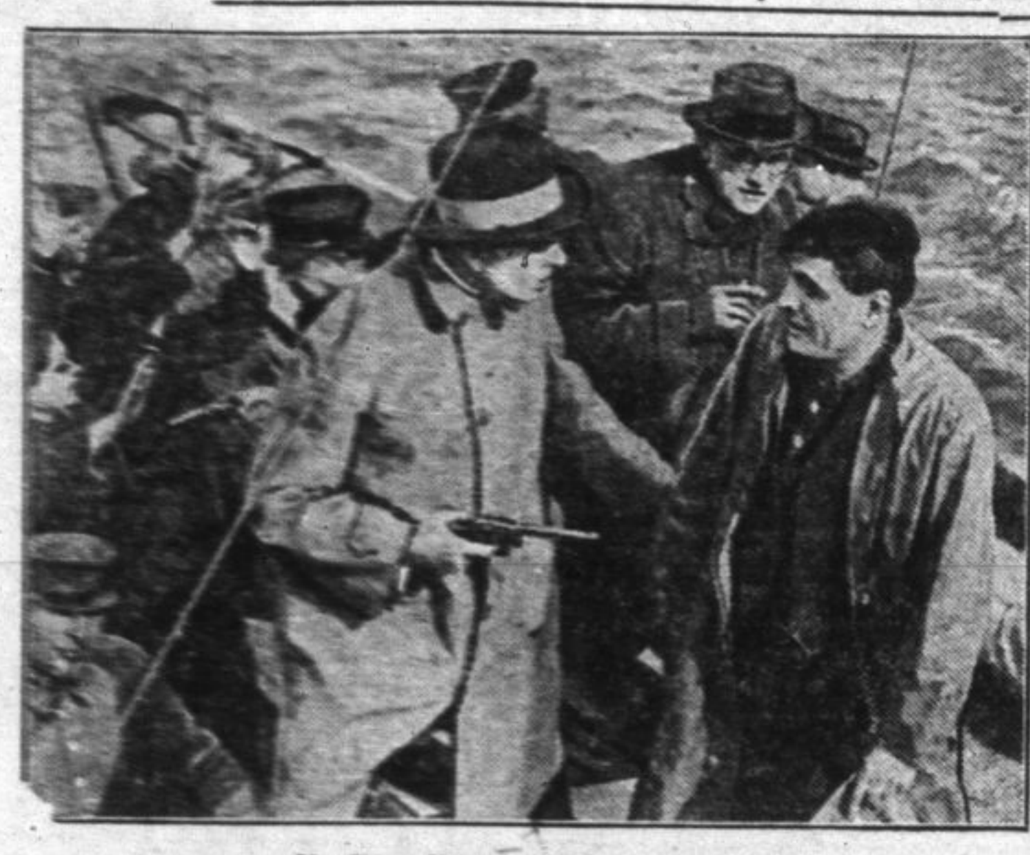
He Was Wearing Craig's Clothes.

Quest ascended the stairs and entered a wholly unfurnished room on the left-hand side. He looked for a minute contemplatively at a large but rather shallow cupboard, the door of which stood open, and tapped lightly with his forefinger upon the back part of it. Then he withdrew a few feet and, drawing out his revolver, deliberately fired into the foot a few inches inside. There was a half-stifled cry. The false back suddenly swung open and a man rushed out. Quest's revolver covered him, but there was no necessity for its use. Craig, smothered with dust, his face white as a piece of marble, even his jaw shaking with fear, was wholly unarmed. He seemed, in fact, incapable of any form of resistance.