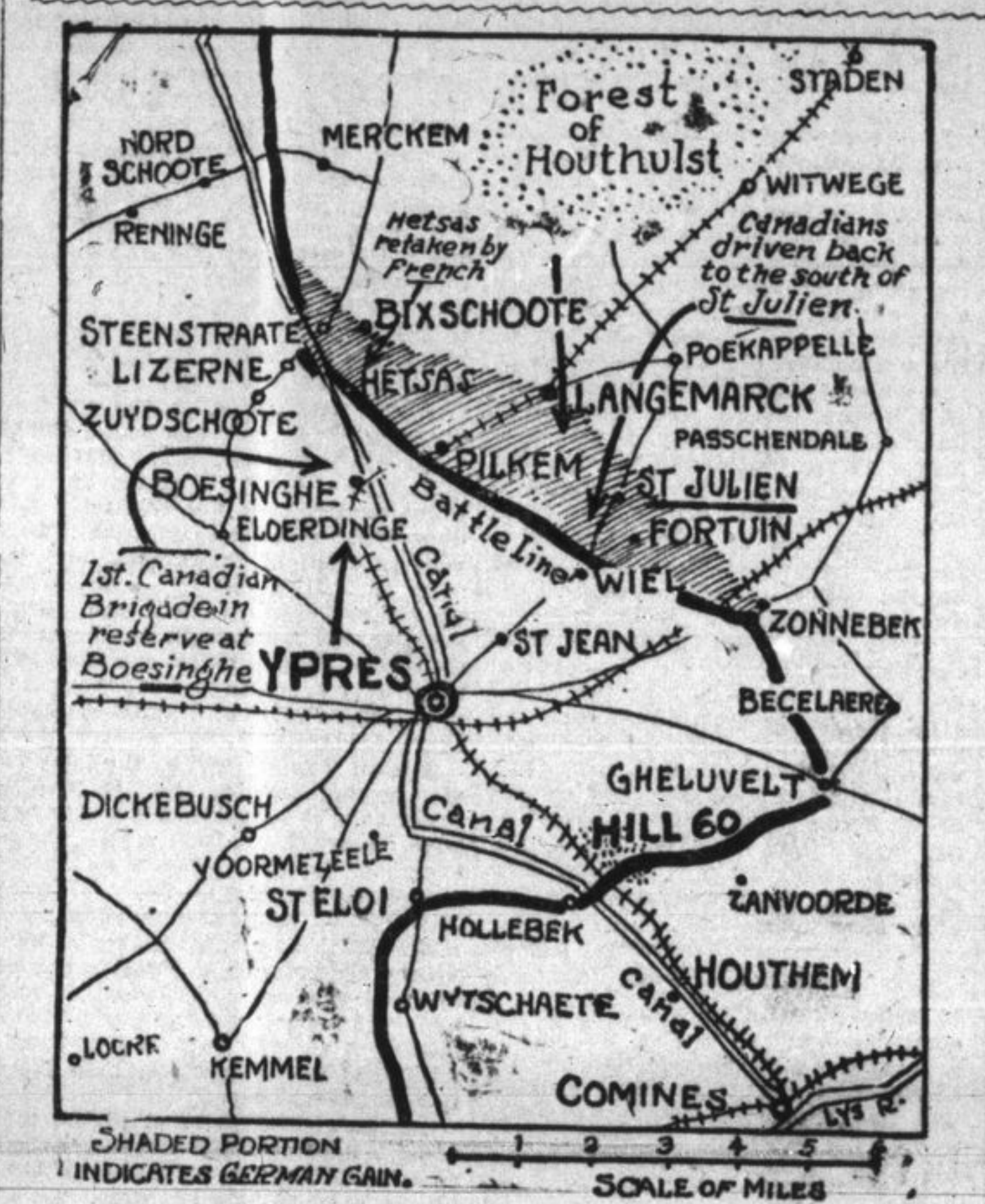
THE STUBBORN BATTLE FOR YPRES. Hetsas and Lizerne were recently recaptured after the Langemarck defeat, by the Allies. The battle line shows Ypres is now being attacked from three angles.