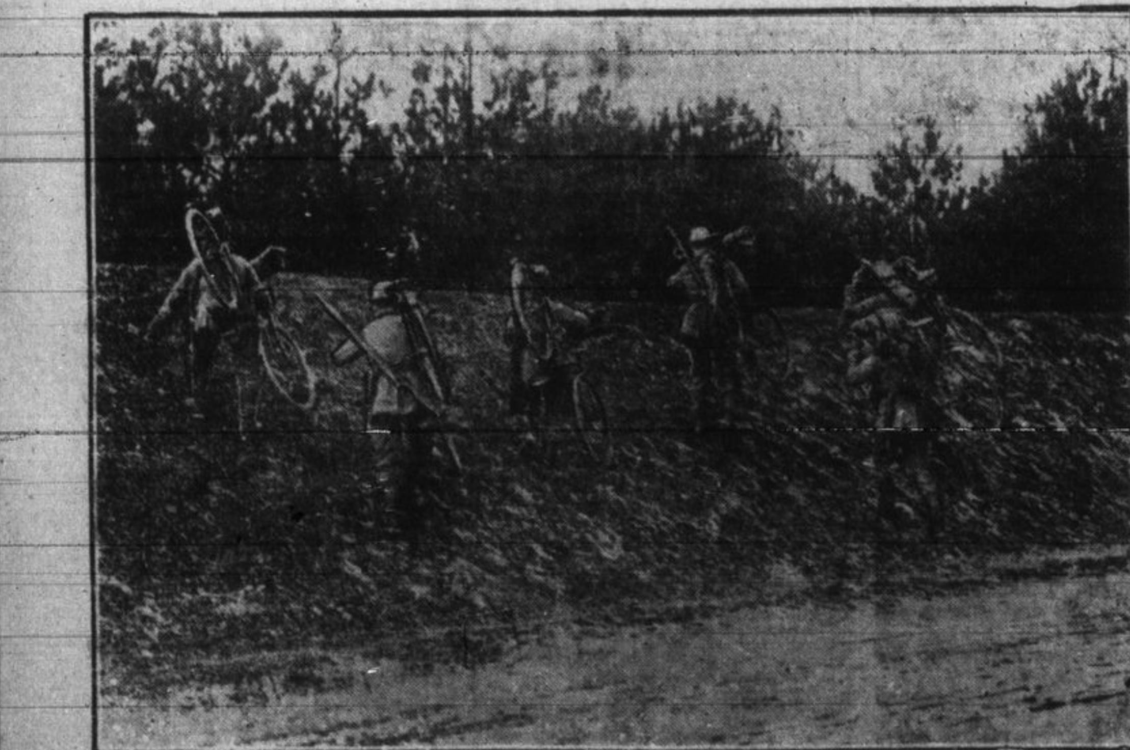
THE BICYCLE PLAYING A BIG PART IN WAR.

Enjoy life! Spring is here and your system is filled with the winter's accumulation of bile and bowel poison—which keeps you bilious, headachy, dizzy, tongue coated, breath bad and stomach sour.—Why don't you get a 10-cent box of Cascarets at the drug store and feel fine—Take Cascarets to-night and enjoy the nicest, gentlest liver and bowel-cleansing you ever experienced—Give Cascarets to children now.