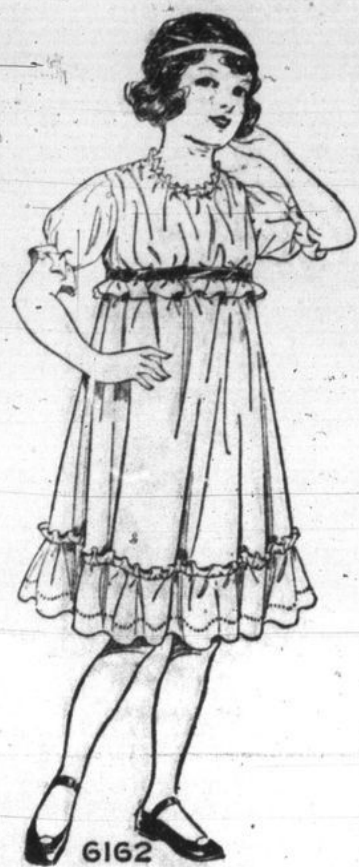
Delightful little frock in pink mull made in Empire style for the growing girl.

What is more comfortable and at the same time more adorably pretty for the growing girl than an Empire frock in soft clinging material?