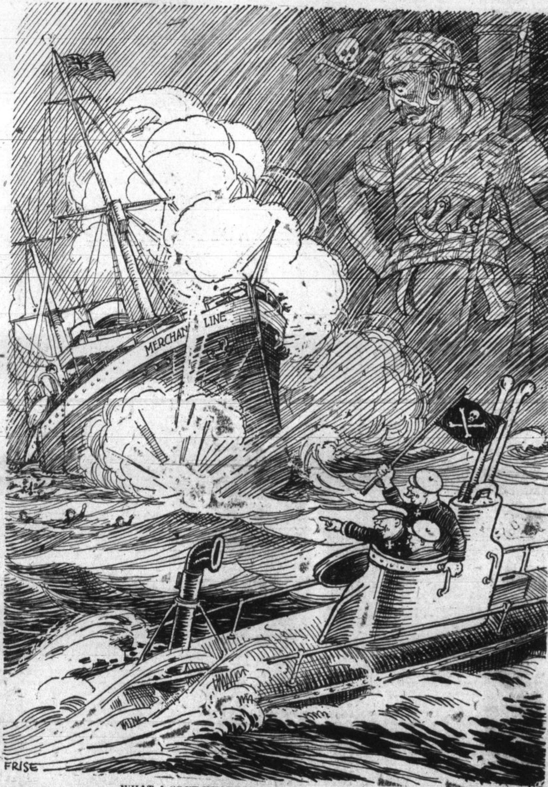
FRISE. WHAT A SOFT-HEARTED OLD PIKER I WAS IN MY DAY!