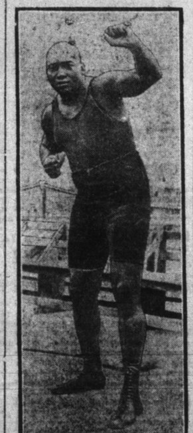
JACK JOHNSON IN TRAINING.