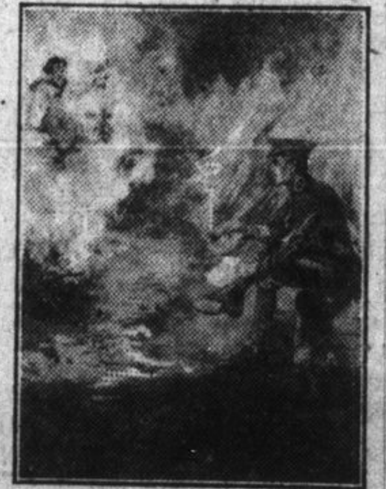
A scene from "It's a Long Way to Tipperary" the play as being presented by the Grand Opera House on Saturday, March 20th, matinee and night.

The man who passed the bill is described as being about five feet eight inches in height, and weighing about 150 pounds. It is believed that at the time he was in the store he wore a false moustache.