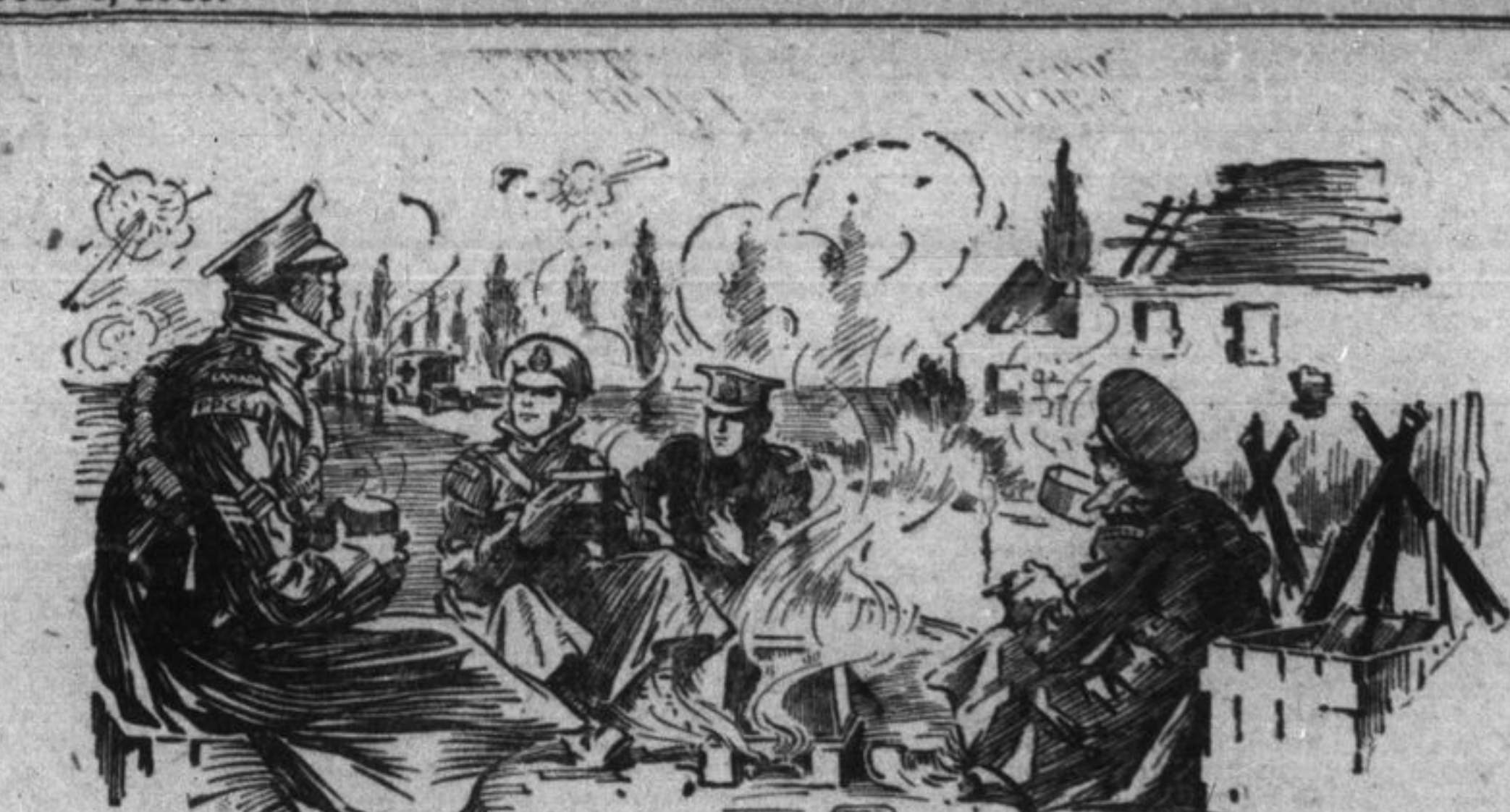
PRINCESS PATRICIA'S AT THE FRONT