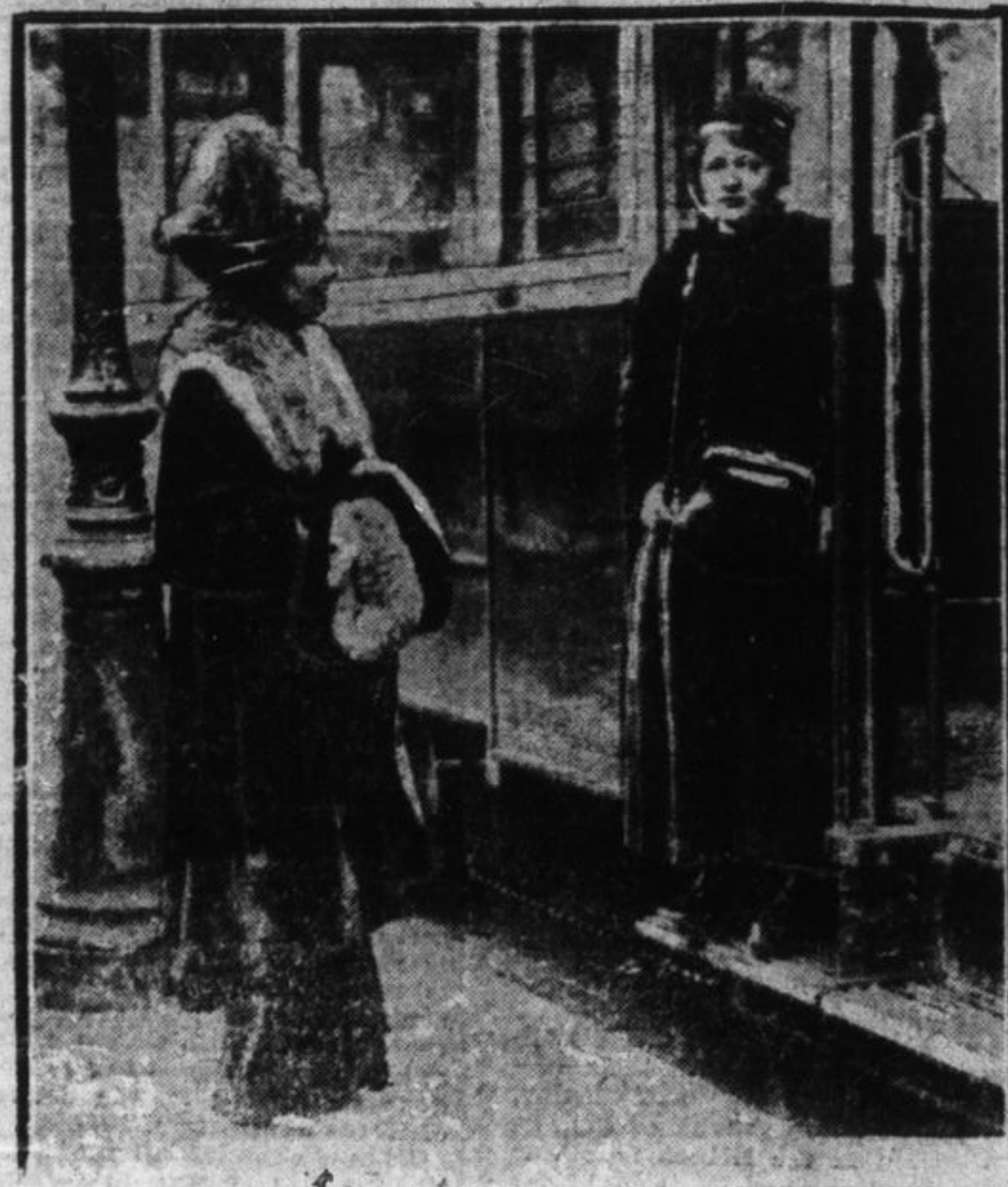
MILITANT SUFFRAGETTE AIDS COUNTRY INSTEAD OF FIGHTING IT.