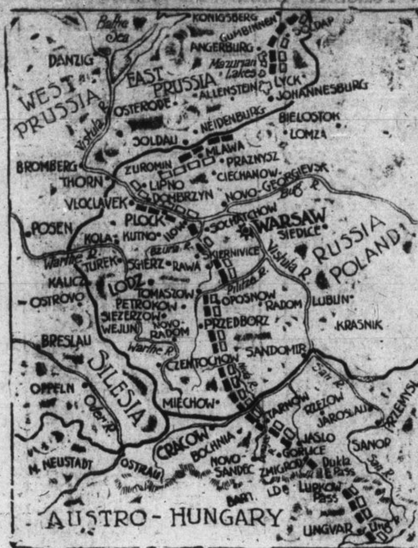
THE SITUATION IN THE EAST.

If, though weary, we are not discouraged, And insist that our lives are worth while, Our griefs will die quickly unavailing, And we'll end the next year with a smile.