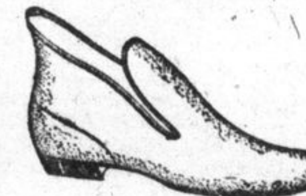
Baby Cosy Slippers, 50c.