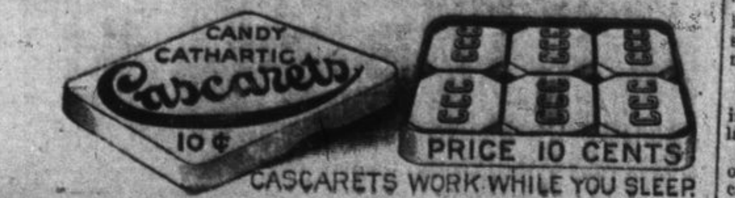
CASCARETS WORK WHILE YOU SLEEP

Turn the rascals out—the headache and carry off the decomposed waste biliousness, constipation, the sick, inatter and constipation poison from their out-to-night with Cascarets. Then you feel great.