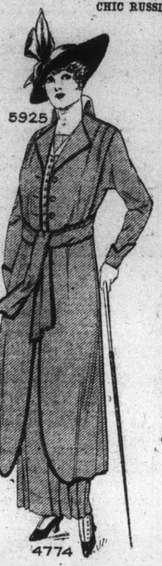
Blue and black kitten's ear cloth, trimmed with silk braid and a vest of white cloth, is used for this stunning costume.

Prepared Especially For This Newspaper by Pictorial Review