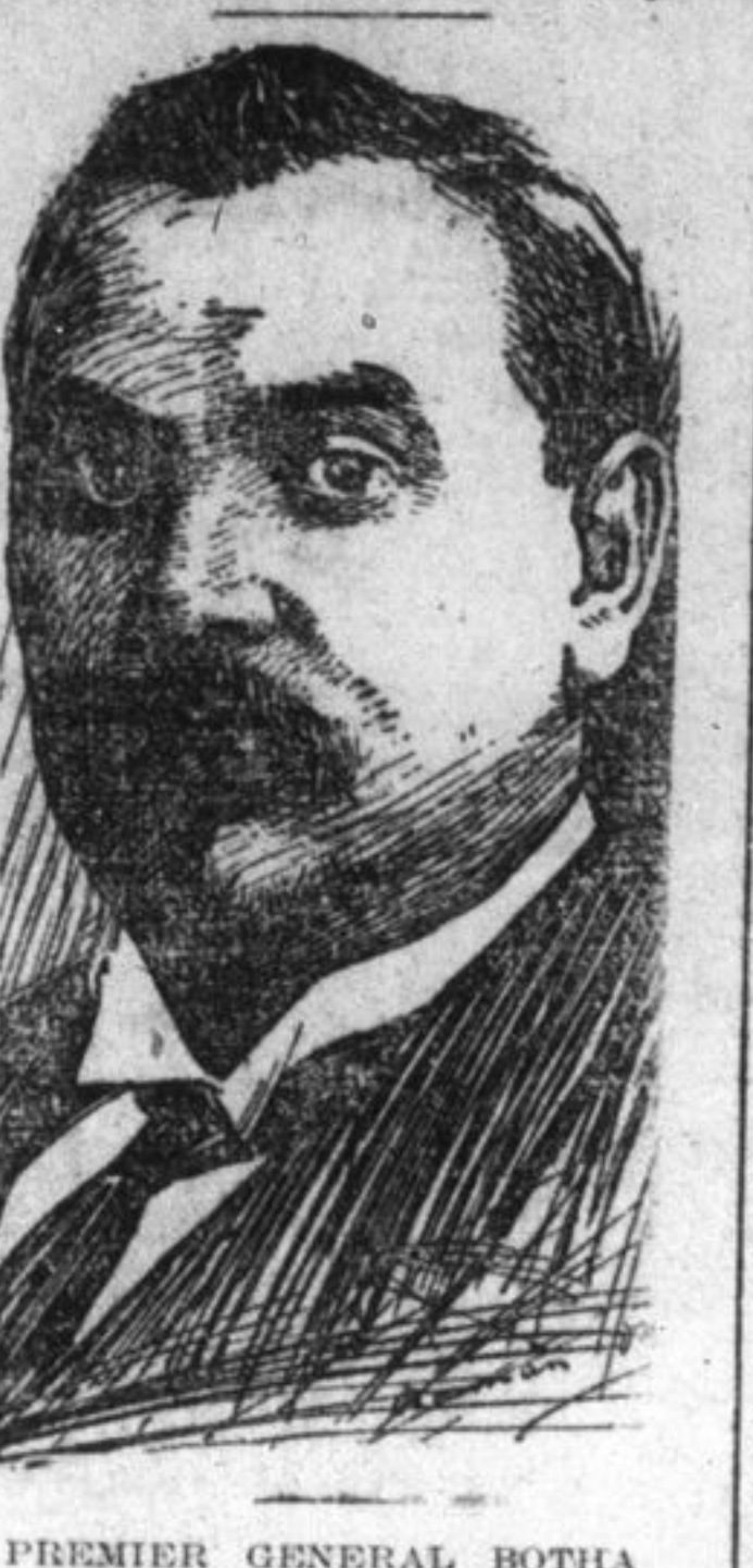
PREMIER GENERAL BOTHA