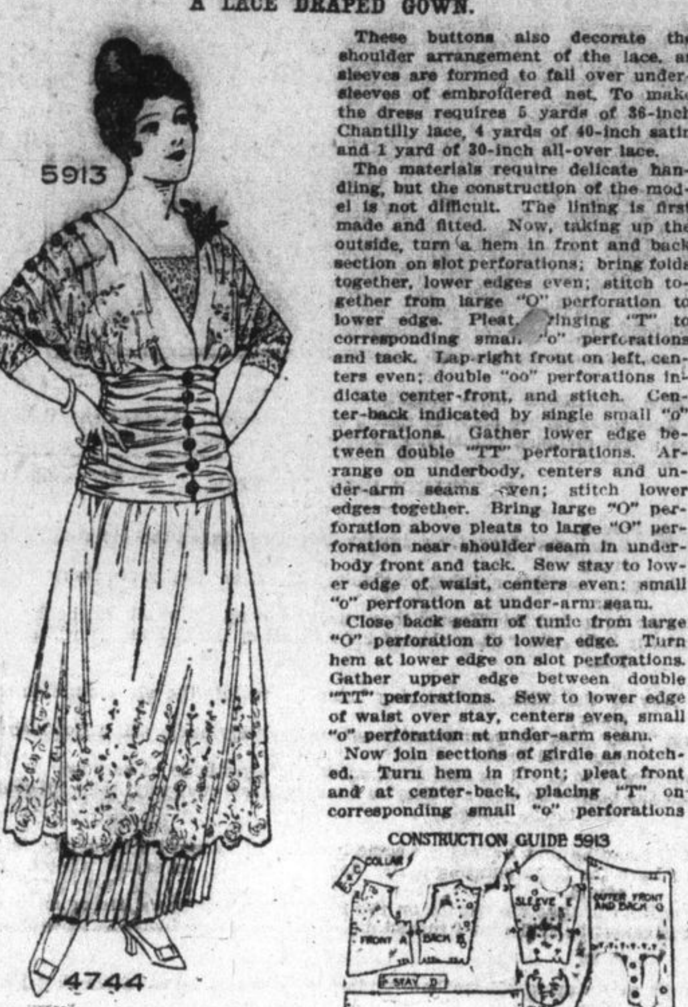
Chantilly lace dancing frock built over cream colored satin and trimmed with novel buttons of very narrow braid.

Prepared Especially For This Newspaper by Pictorial Review