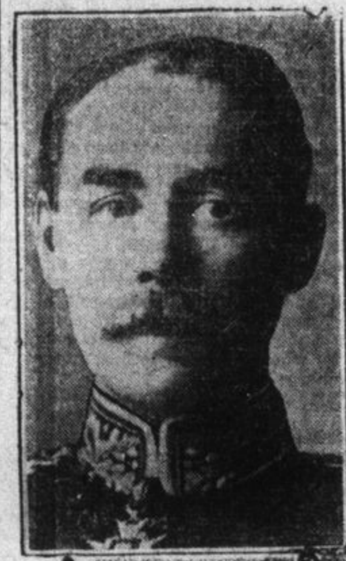
SIR A. J. MURRAY Chief of staff of Sir John French. He served both in Zululand and in South Africa.

Once the allies re-enter Brussels unless the unexpected happens, and the Germans are able to bring great reinforcements from the Russian frontier, they must fall back from France and Belgium, owing to the tremendous pressure against their right wing.