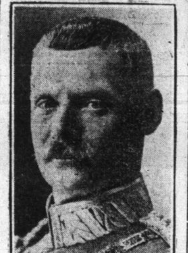
CROWN PRINCE SUPRECHT OF SAVARIA

Who is reported to have been captured by the allies' troops near Nancy. He was in charge of the German army hammering at the forts between Verdun and Toul.