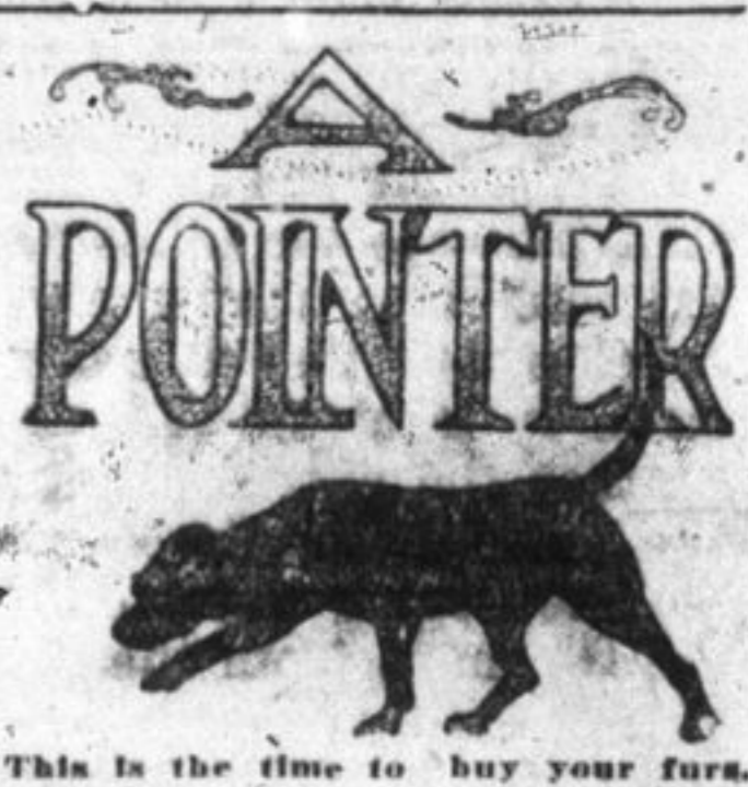
This is the time to buy your fur. You have a better assortment to choose from, at

Smith Bros., Jewellers Opticians Issuers of Marriage Licenses