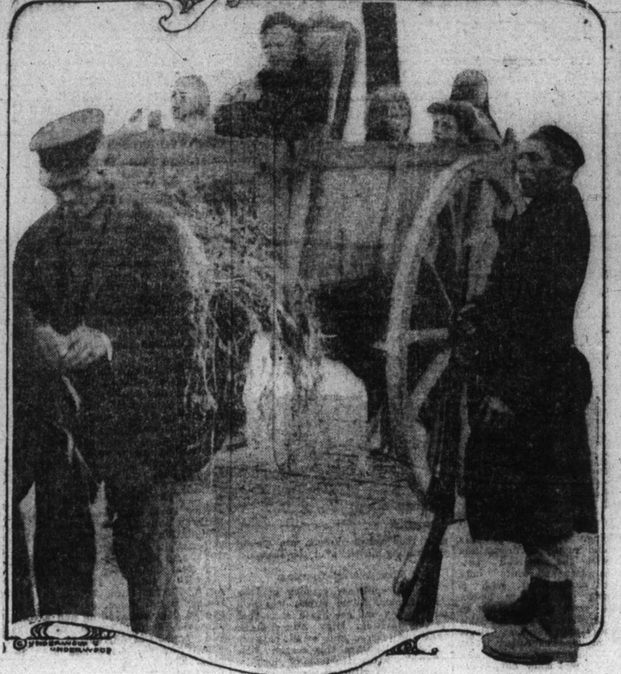
BELGIAN PEASANTS FLEEING FROM THE CITY OF LOUVAIN, WHICH THE GERMANS BURNED.

Married At Mallorytown. Mallorytown, Sept. 9.—At noon on Wednesday, Sept. 9th, a pretty wed-