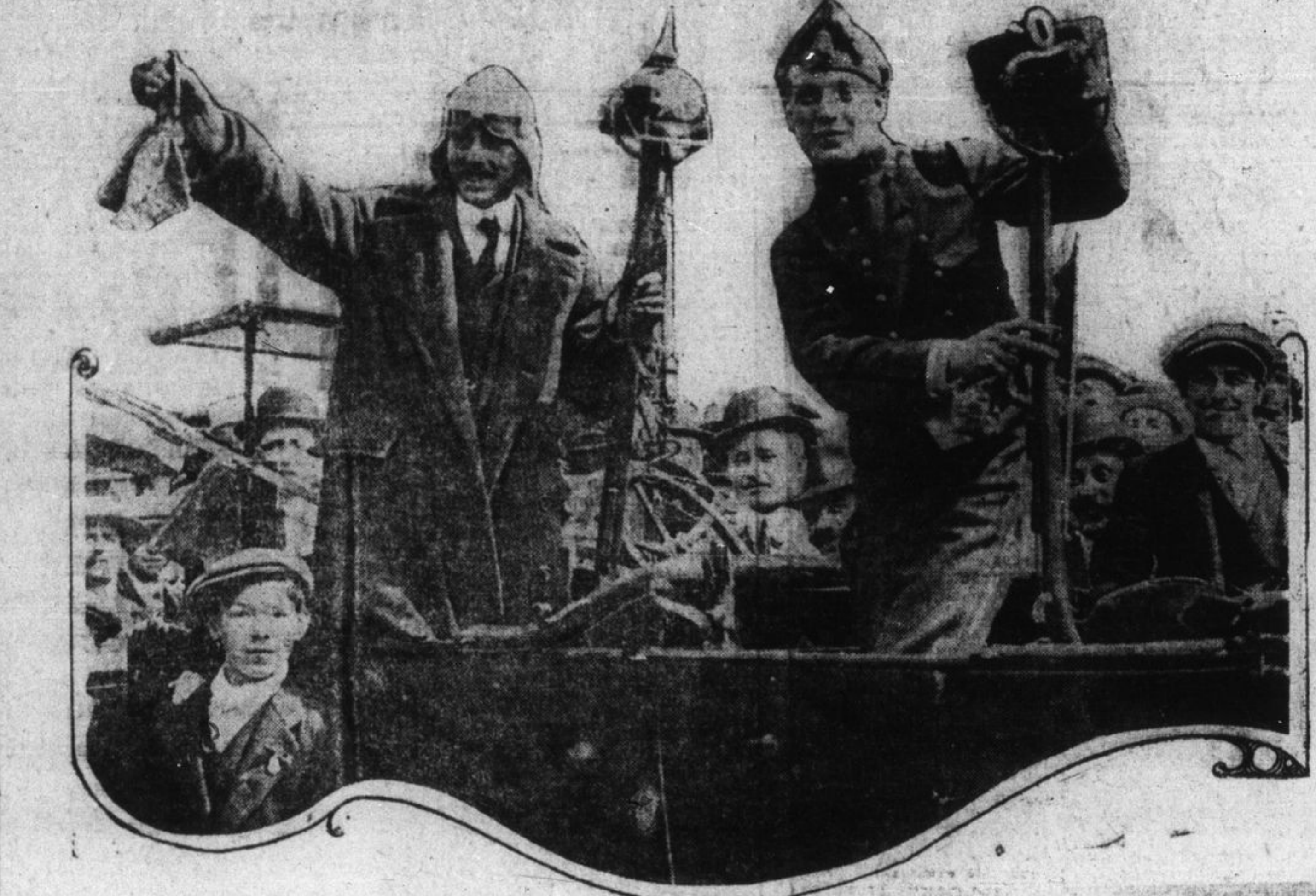
PROUD BELGIAN SOLDIERS SHOW CAPTURED TROPHIES. To delighted crowds in Belgian capital. German helmet and bayonet are seen in the foreground. This photograph was taken in Brussels several days after the fighting started at Liege.