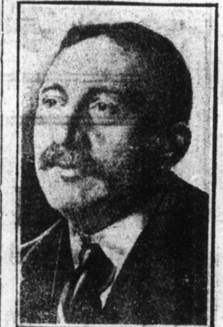
RENE VIVIANI. New picture of the premier of France who is much in the public eye during the present war crisis.