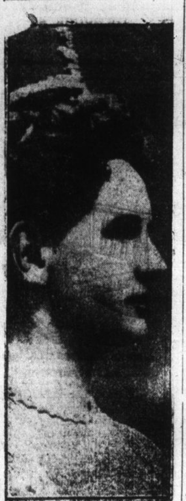
QUEEN WILHELMINA. What, so far, has refrained from taking any steps against Germany, but who may be compelled by anti-German feeling in Holland to send an ultimatum to the Kaiser inquiring what his intentions are.