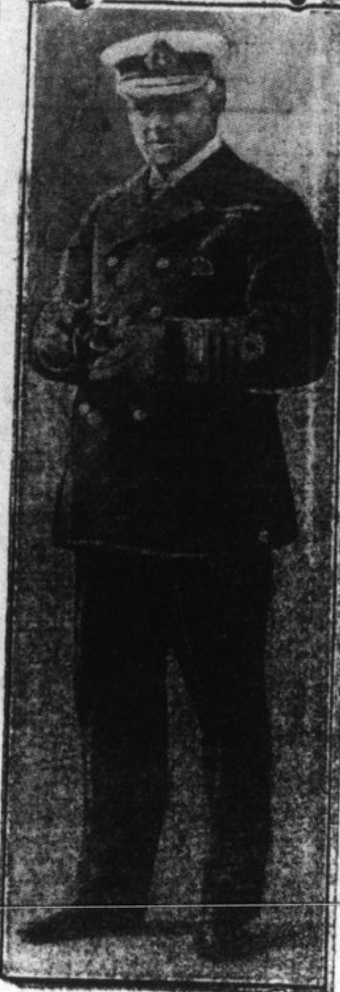
ADMIRAL SIR GEO. CALLAGHAN Who is in charge of the First Battle Squadron of the British navy

Ottawa, Aug. 8.—The militia department states that there will be no trouble at all about equipment of arms and that there are sufficient supplies available for practically the whole of the active militia in Canada.