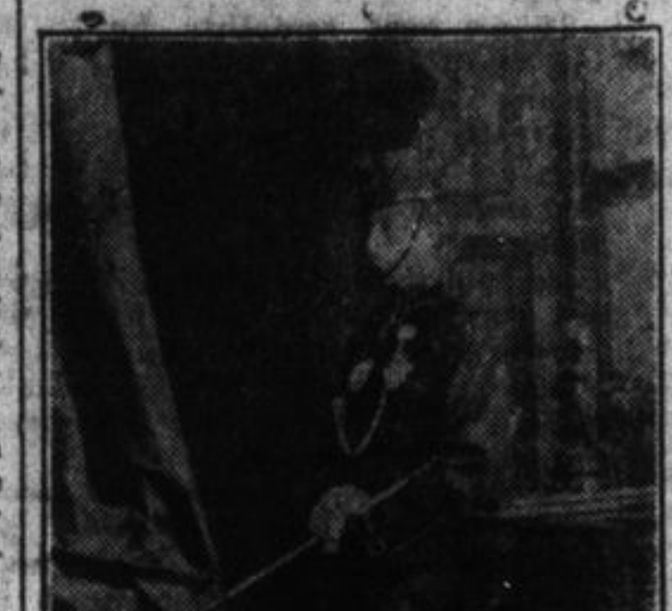
DUKE OF CONNAUGHT When he visited Kingston in the year 1869.