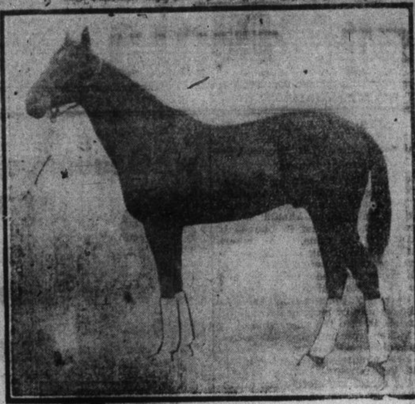
FAVORITE FOR THE KING'S PLATE.

"It's exactly as I've always said, mother; women lack strategy."