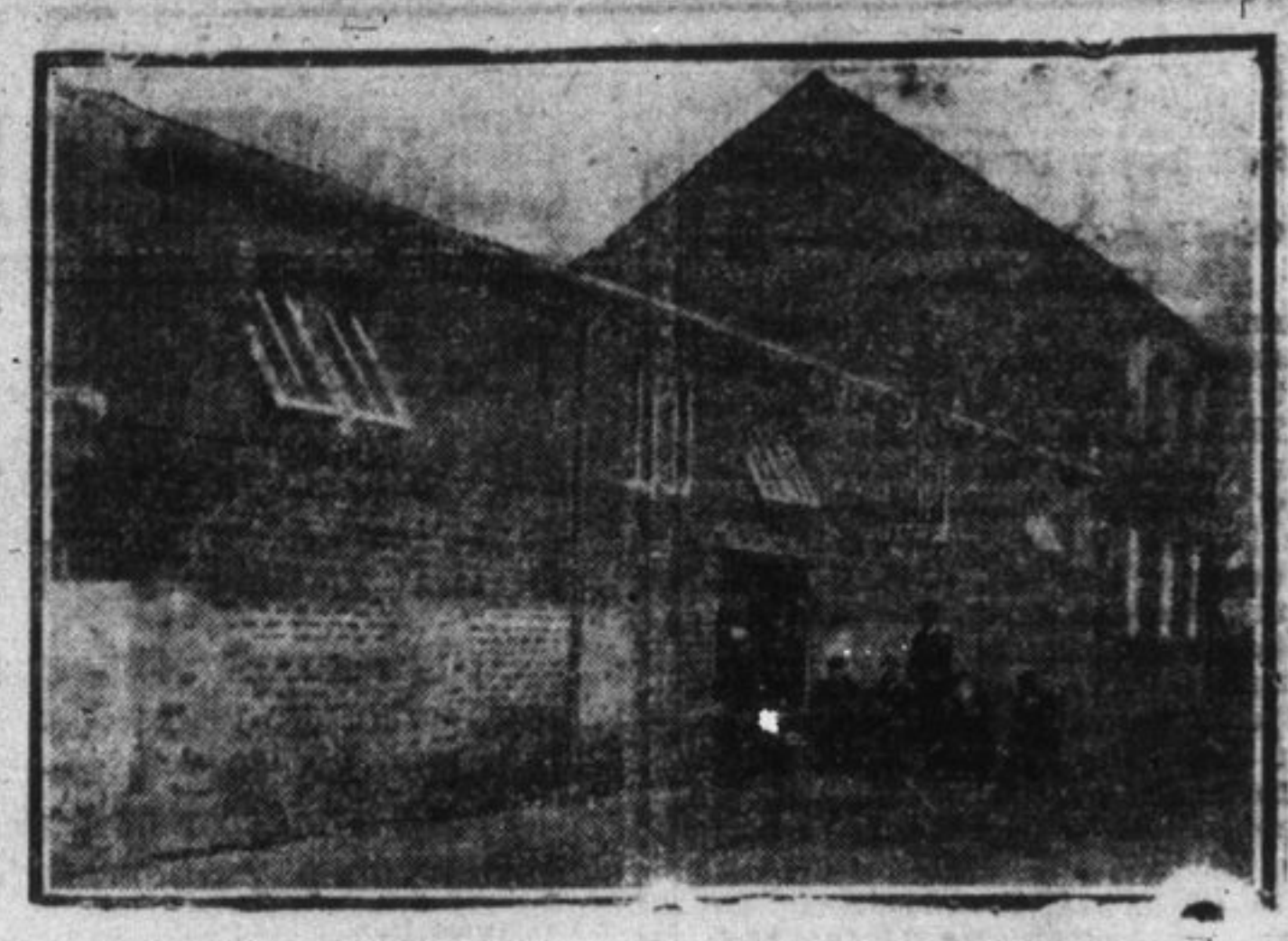
AN ULSTERITE DRILL HALL AT LIMAVADY. The building to the left (low section) was built by the Ulsterites at Limavady specially for drilling purposes. The money was raised in the town which has 2,500 people, half Catholic. Carson spoke there lately.

Clearing sale of children's walking slippers less than half price, Dutton's. Penslar Almond Cream, Gibson's.