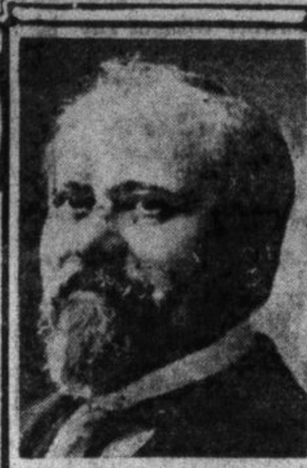
PRESIDENT POINCARÉ, FRANCE.