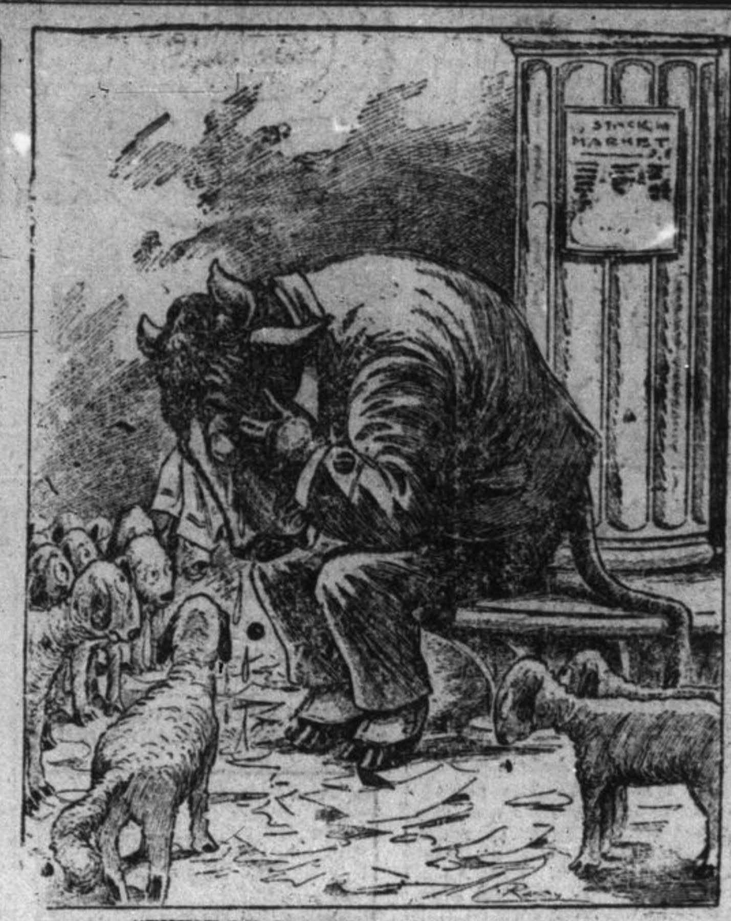
"THESE BE GLOOMY DAYS."—Montreal Star.

London, March 25.—Having failed to rouse London to any great pitch of indignation, the nine deported South African labor leaders are now touring the industrial cities of the United Kingdom, under the auspices of the National labor party, with the object of evoking sympathy. At Glasgow, before an audience of 3,000 persons, they vituperated Premier Bothera and Gen. Smuts, and declared their intention of returning to South Africa.