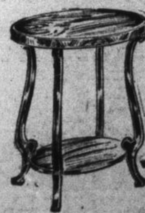
Fancy Mahogany Pedestals & Tables.

A Huge Success—Loads Leaving for Country and City.