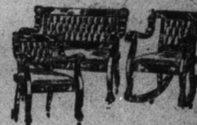
Solid Mahogany Parlor Sets, Brass Bedsteads, Circassian Walnut Dressers, Kellaric Mattresses, and Leggett and Platt Springs. Reid Quality, Reid Low Prices.