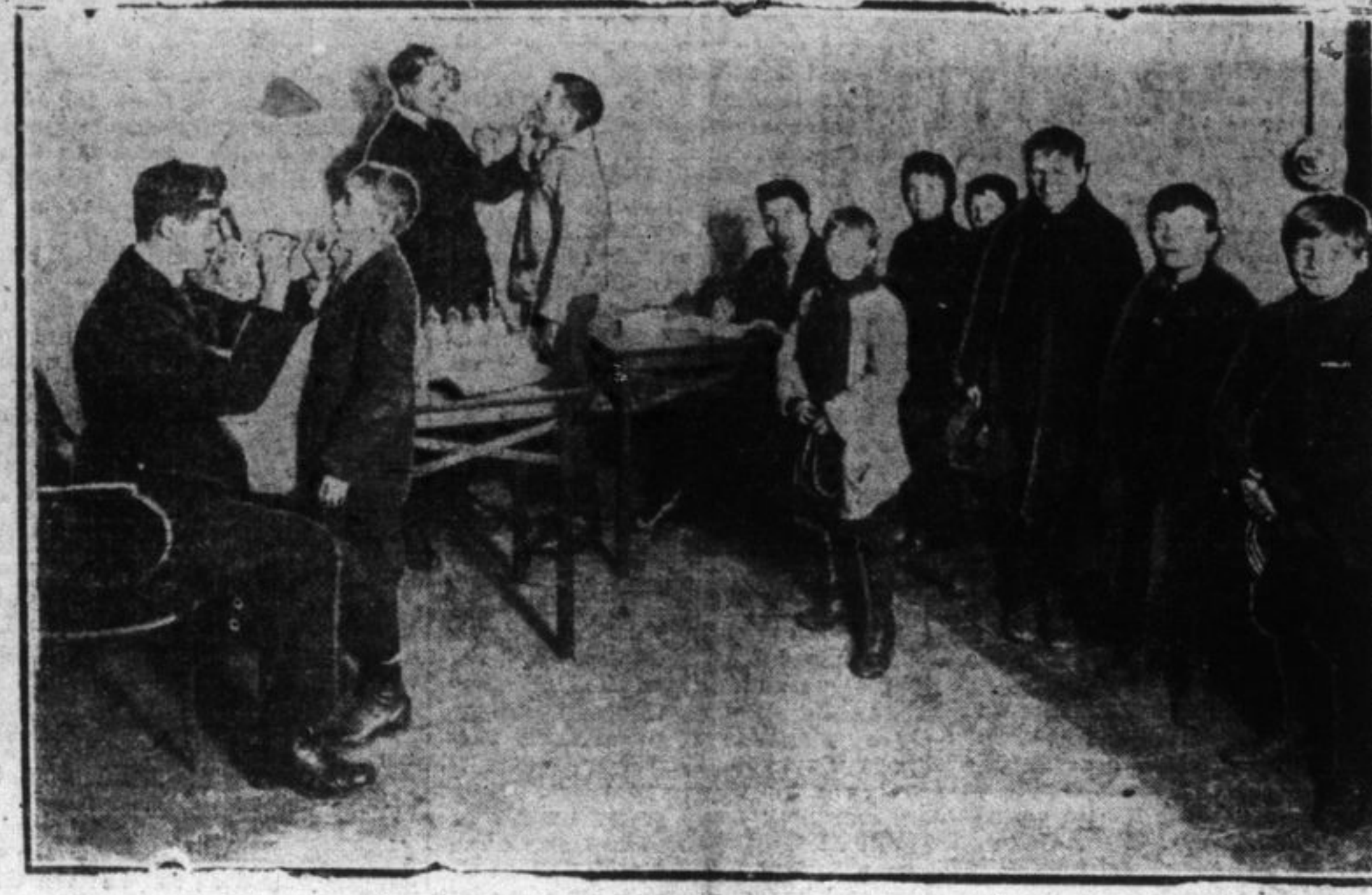
THE NEW CIGARETTE CURE. Following the lead of several United States institutions in promoting a new cigarette cure several Canadian institutions are now handling this cure, which so far has proved itself very valuable. The picture shows doctors and attendants in one of our Canadian cities swabbing the throats of cigarette smokers. This practice will soon spread all over Canada, as it has proved so beneficial where it has been given trial.