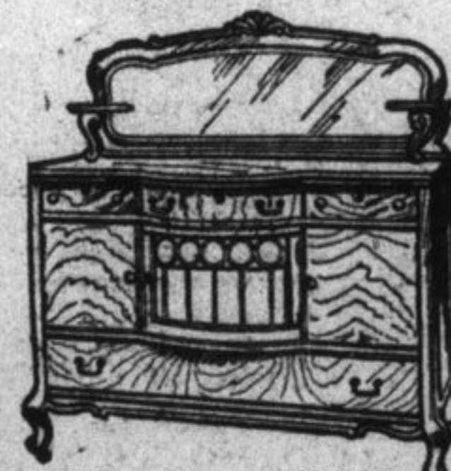
Buffets and Round Extension Tables and Dining Room Chairs.