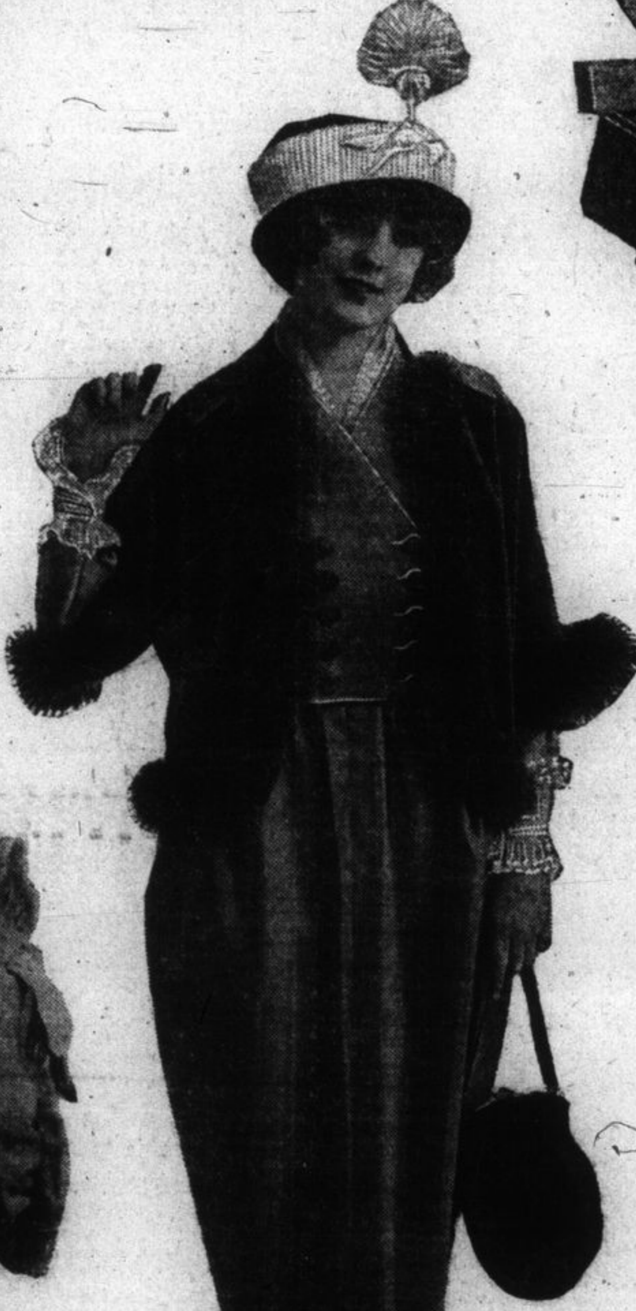
Short Kimono Coat with Fur-Top Skirt.