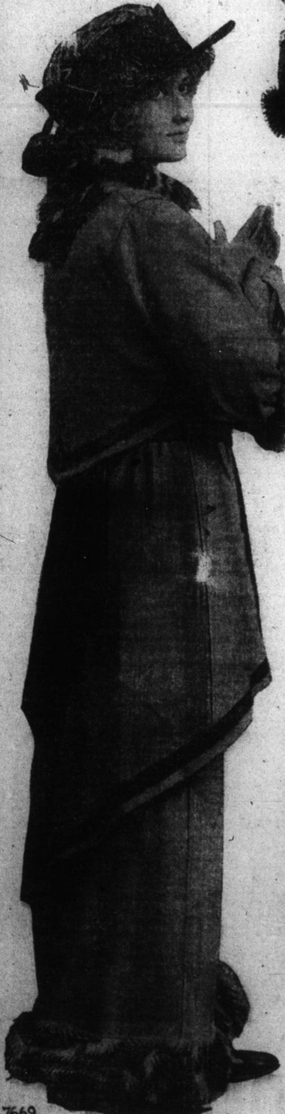
7669 Pointed Bolero Jacket Matching Tunic Outline

THIS very new model suit in castor broadcloth and corduroy shows a novel loose jacket on kimono lines, reaching only to the hip. It partakes of the modish bolero effect in front, while the middle back is cut so that the fullness falls in a graceful plait on either side, and is held down by ornamental buttons. A surprise vest also appears, with a double row of buttons. Marabout edges the jacket, which can be reproduced with pattern No. 8140 for either ladies or misses. The skirt, No. 7968, is a four-piece peep-top reaching slightly above the normal waistline.