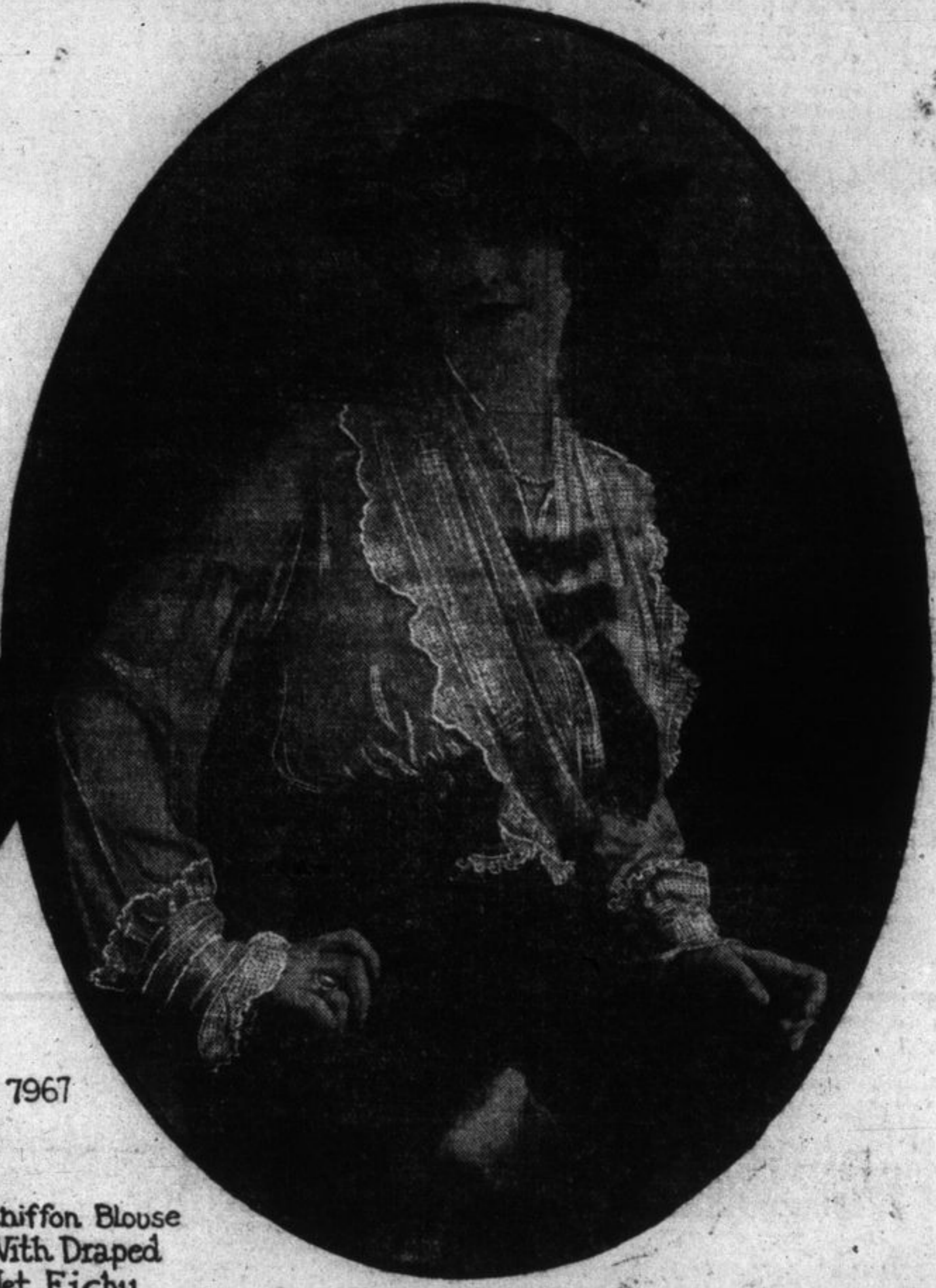
Chiffon Blouse With Draped Net Fichu.