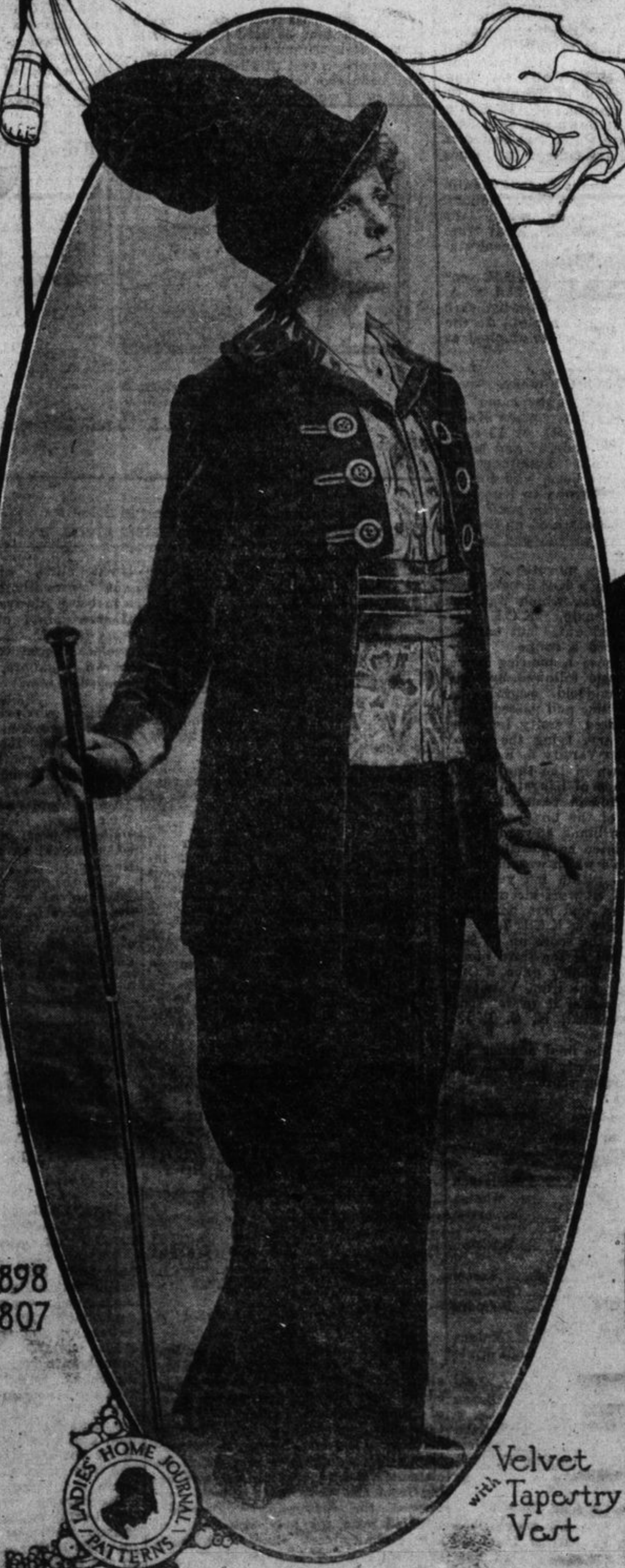
Velvet Tapestry Vest