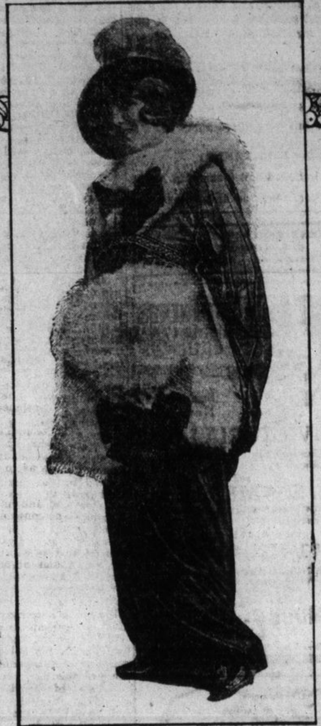
Snowy - Fox - Set

C ANDLES with artistic shades add much to the decoration of a room and its lighting as those know who have used them. Stenciled shades in the two designs here shown, and four other styles may be made from a group of cut patterns (No. 14159). Black Bristol board is frequently used, with any light silk or Japanese paper for the lining. Color combinations may be made by tinting sections of the designs through the spaces, on the linings, using water colors or oil mixed with gasoline. The peacock motif is graceful, not only for craftsmen shades, but for cushions and table runners of crash. The price of the pattern is 15-cents.