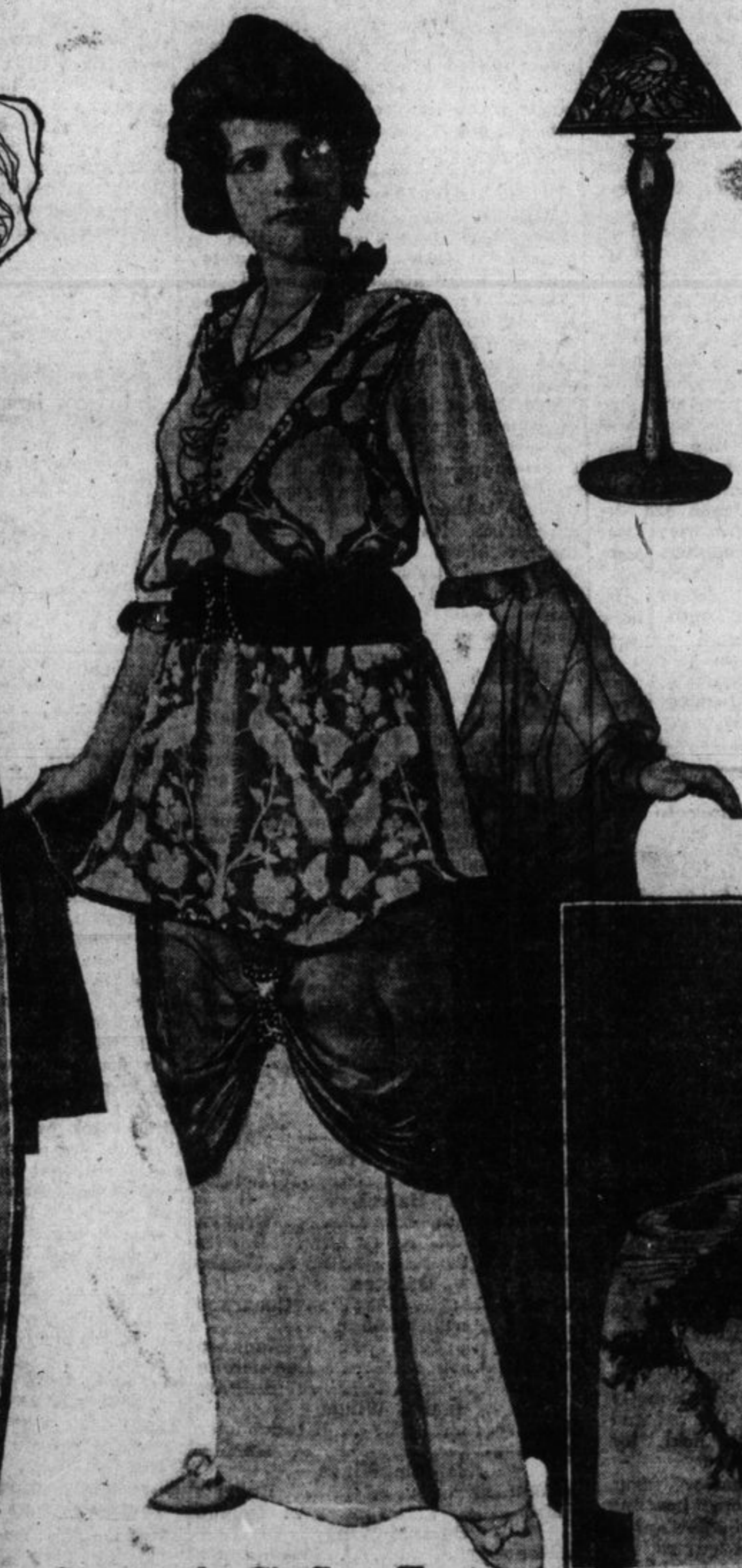
Printed - Chiffon - Tunic