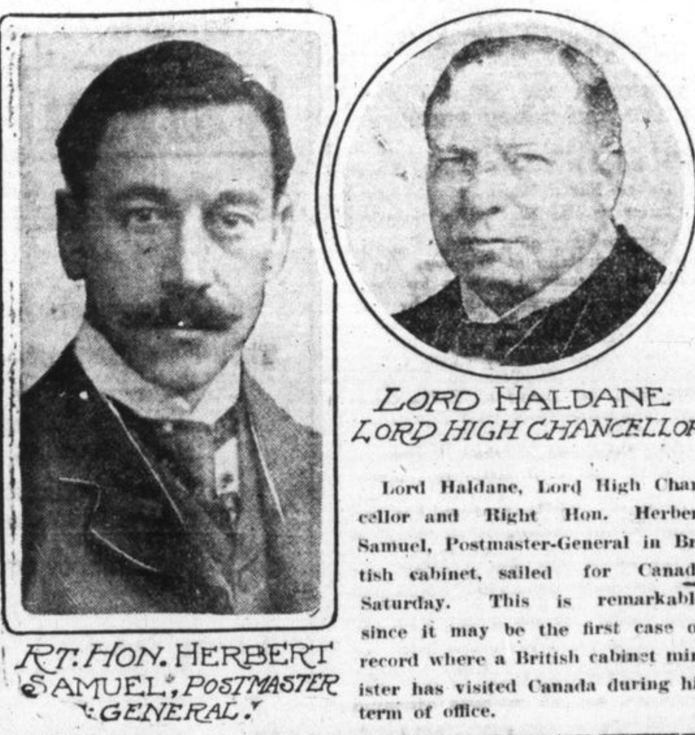
LORD HALDANE. LORD HIGH CHANCELLOR